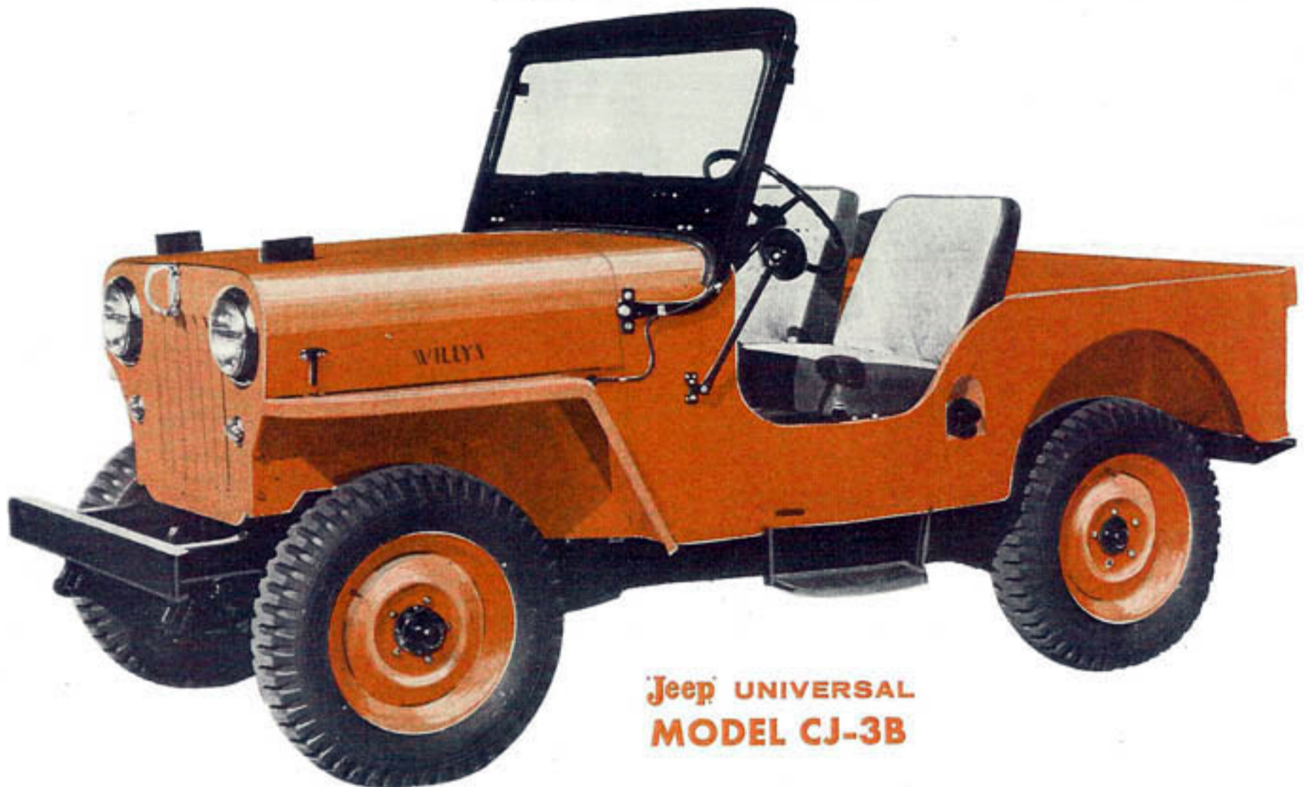
Jeep UNIVERSAL MODEL CJ-3B