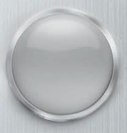
SILKY SILVER (LX, S, EX) YOU NOTICE THE SUBTLE IRONIES IN LIFE. NOTHING IS EVER BLACK AND WHITE TO YOU.