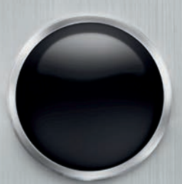
AURORA BLACK (LX, S) YOU'RE A NIGHT PERSON WHO ENJOYS EATING LICORICE WHILE WATCHING FILM NOIR.