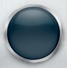
SMOKE BLUE (EX) YOU LIKE LISTENING TO THE BLUES AROUND A CAMPFIRE AT TWILIGHT. CURRENT MOOD: MELLOW.