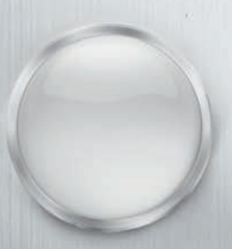
CLEAR WHITE (LX, S, EX) YOU ARE OPEN TO EXPLORING ENDLESS POSSIBILITIES. YOUR GLASS IS ALWAYS HALF-FULL.