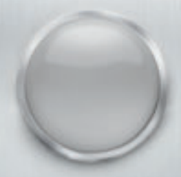
SILKY SILVER (LX, S) YOU NOTICE THE SUBTLE IRONIES IN LIFE. NOTHING IS EVER BLACK AND WHITE TO YOU.