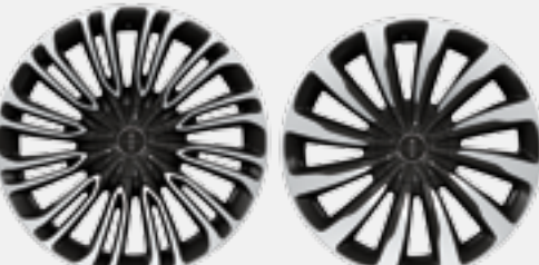
Aviator Grand Touring

Awaken your senses to the invigorating contrasts of the Chalet theme. This bold Alpine and Espresso colored interior is inspired by crisp mountain air and the comfort of an après-ski lodge. Lincoln Star perforation pattern inserts on the Savannah leather 1st- and 2nd-row seats and the Lincoln Black Label Star logo etched into the instrument panel's Silverwood appliqué exemplify the luxuries within this striking space.