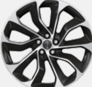
Aviator Grand Touring 21" Ultra Bright-Machined Aluminum with Dark Alloy-Painted Pockets Included with Grand Touring II Equipment Collection Available on Grand Touring and with Grand Touring I Equipment Collection