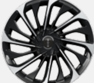
Aviator Reserve 22" Ultra Bright-Machined Aluminum with Magnetic-Painted Pockets Included with Reserve II Equipment Collection Available with Reserve I Equipment Collection