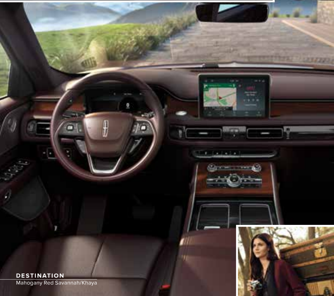
DESTINATION Mahogany Red Savannah/Khaya