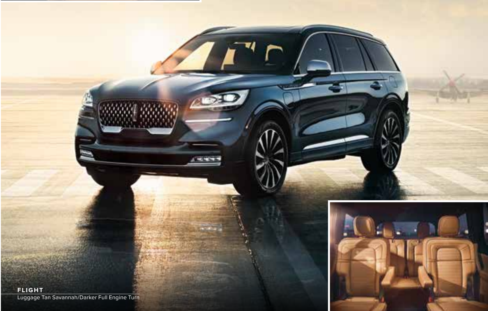
FLIGHT Luggage Tan Savannah/Darker Full Engine Turn