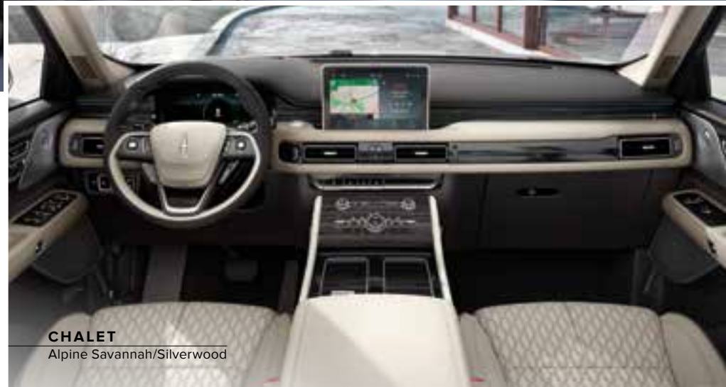
CHALET Alpine Savannah/Silverwood