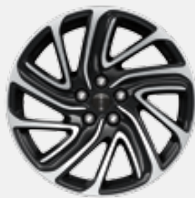
Aviator 19" Bright-Machined Aluminum with Dark-Tarnish Premium Painted Pockets Standard

Start taking the fast, smart and friendly way through security with CLEAR