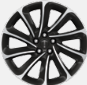
Aviator Grand Touring 20" Ultra Bright-Machined Aluminum with Dark Alloy-Painted Pockets Standard