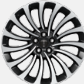
Aviator Reserve 20" Ultra Bright-Machined Aluminum with Magnetic-Painted Pockets Standard