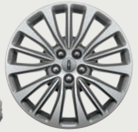
18" Premium Painted Aluminum SELECT