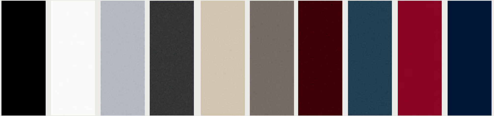
1 Black Velvet 2 White Platinum Metallic Tri-coat 1 3 Ingot Silver Metallic 4 Magnetic Gray Metallic 5 Ivory Pearl Metallic Tri-coat 1 6 Iced Mocha Metallic 1 7 Burgundy Velvet Metallic Tinted Clearcoat 1 8 Blue Diamond Metallic 9 Ruby Red Metallic Tinted Clearcoat 1 10 Rhapsody Blue 1