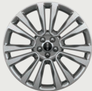
21" Premium Painted and Bright-Machined Aluminum RESERVE Optional