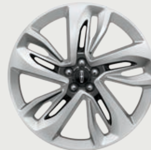
21" Polished Aluminum RESERVE Optional