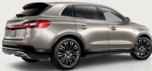
20" Premium Painted and Bright-Machined 20-Spoke Aluminum RESERVE (FWD models; AWD with 3.7-liter)