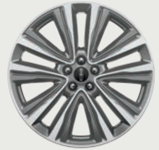
20" Premium Painted and Bright-Machined 10-Spoke Aluminum RESERVE (AWD with 2.7-liter)