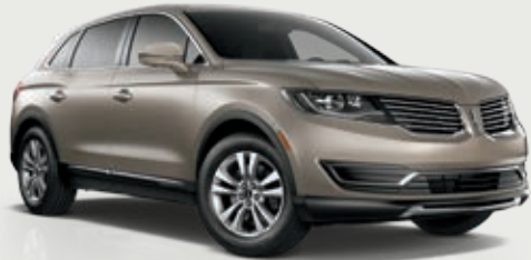
18" Painted Aluminum BASE/PREMIERE / SELECT & RESERVE 1 Available