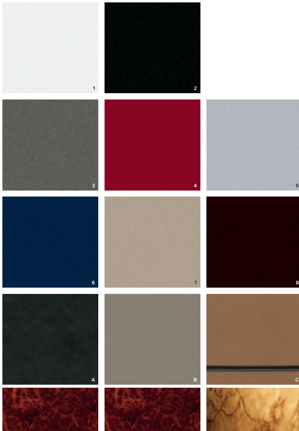
1 White Platinum Metallic Tri-coat 1