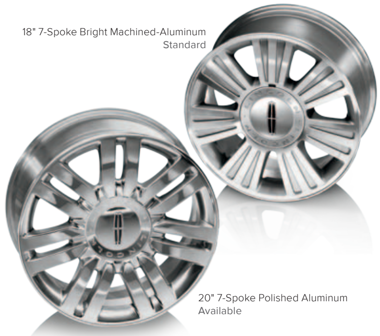
20" 7-Spoke Polished Aluminum Available