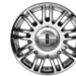
17" 18-Spoke Chromed-Aluminum Optional on Signature Limited and Signature L, standard with the Continental Edition Package