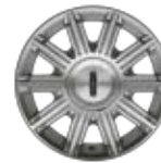
17" 10-Spoke Machined-Aluminum Standard on Signature and Signature L