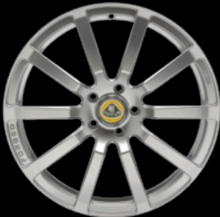
Silver 10-Spoke Forged Wheels (18"/19")