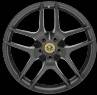
Stealth Grey Y-Type 5-Spoke Cast Alloy Wheels (18"/19")