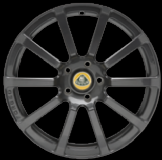
Gloss Anthracite 10-Spoke Forged Wheels (18"/19")