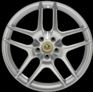
Silver Y-Type 5-Spoke (Standard) Cast Alloy Wheels (18"/19")