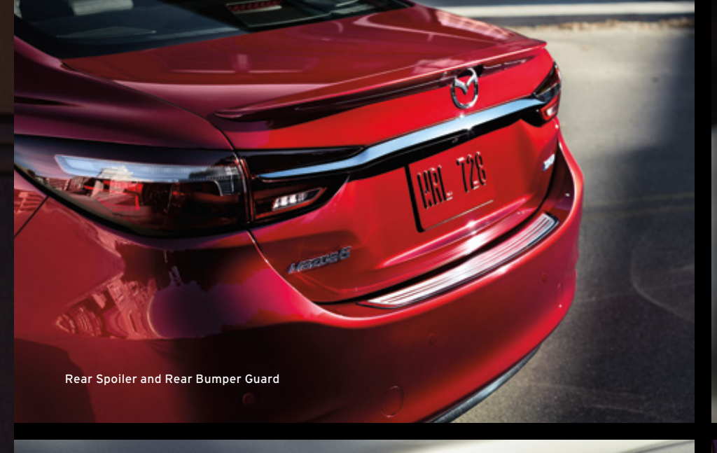
Frameless Auto-Dimming Rearview Mirror with HomeLink®