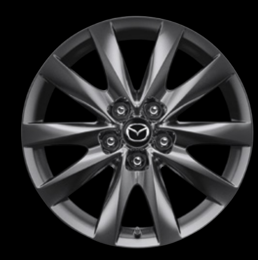
17" Alloy with Gun Metallic finish Sport

EVEN THE WHEELS TELL OUR STORY | Power. Balance.