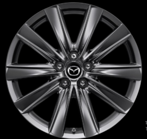
19" Alloy with Gun Metallic finish Touring and Grand Touring