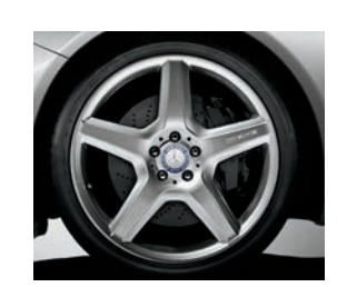
20" AMG 5-spoke (optional on CL 550 4MATIC)