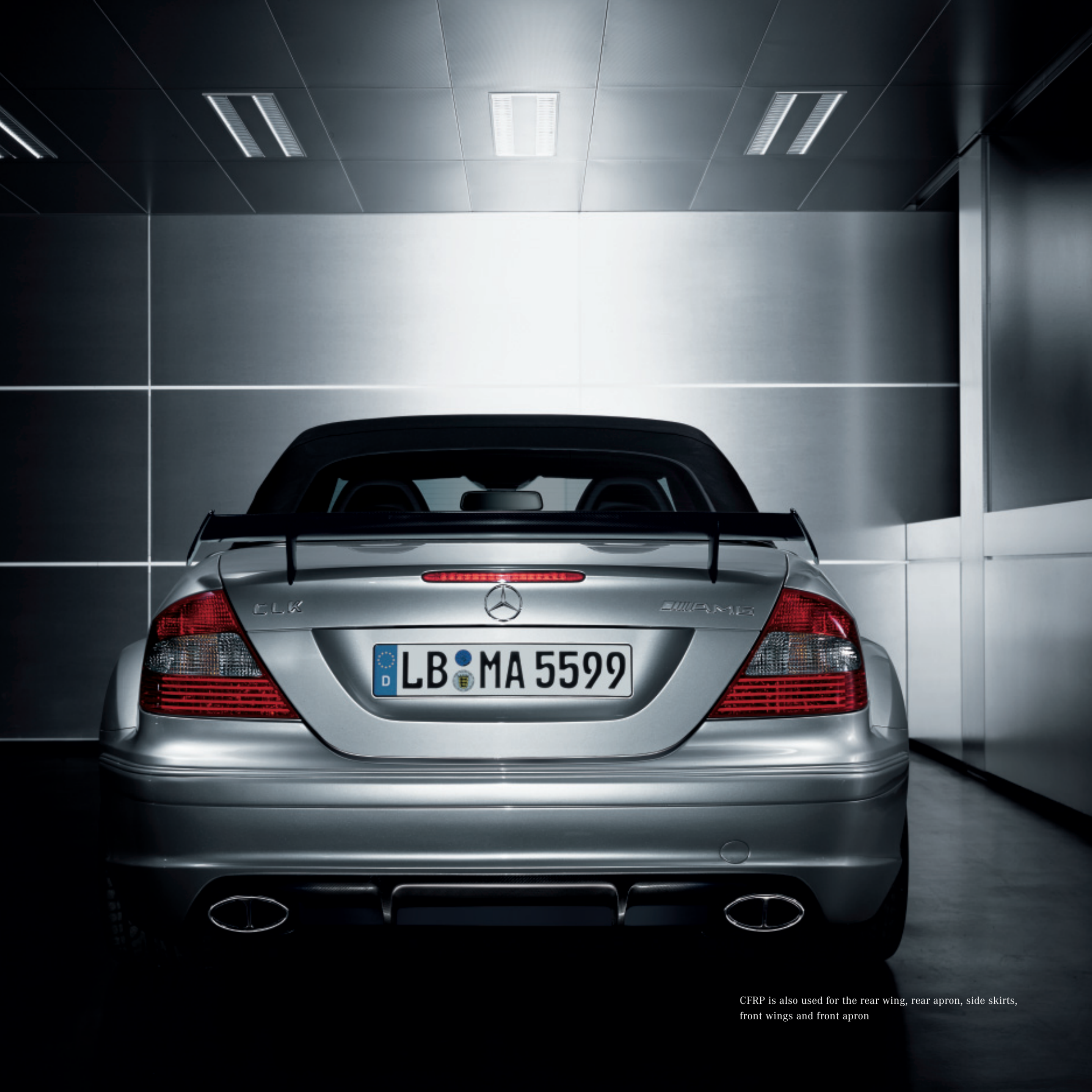
CFRP is also used for the rear wing, rear apron, side skirts, front wings and front apron