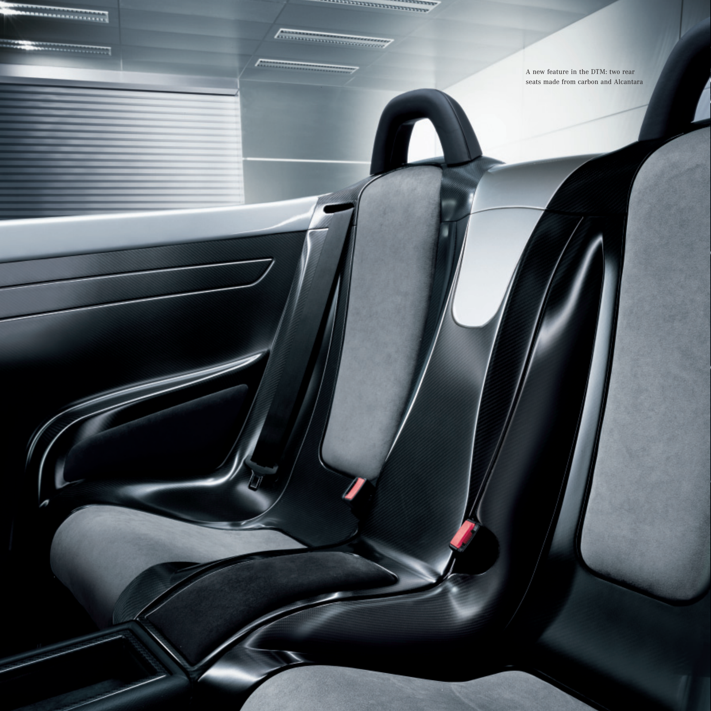
A new feature in the DTM: two rear seats made from carbon and Alcantara