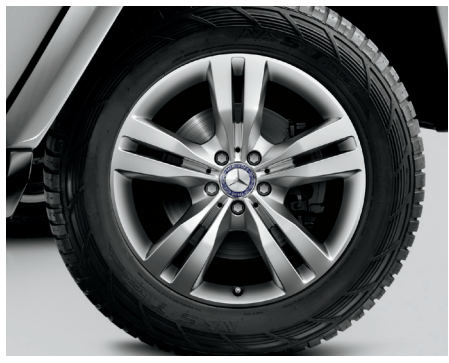
Standard 18" twin 5-spoke in Titanium Grey