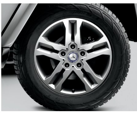
Optional 18" twin 5-spoke in Silver (Edition Select)