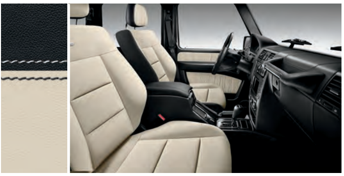
designo Porcelain/Black (Edition Select)