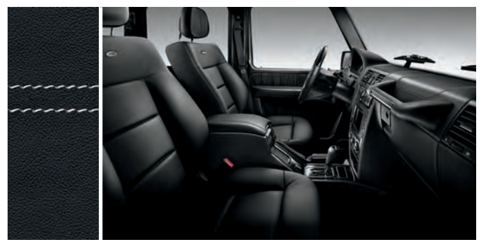
designo Black (Edition Select)