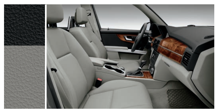
Grey/Black (requires Full Leather Seating Package)