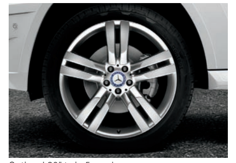
Optional 20" twin 5-spoke (Appearance Package)