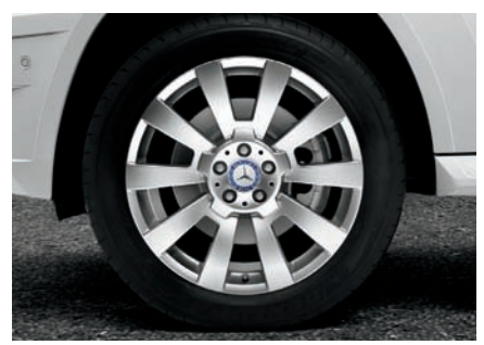
Standard 19" 10-spoke