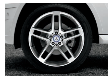
Optional 20" AMG twin 5-spoke (AMG Styling Package)