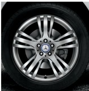
19" triple 5-spoke