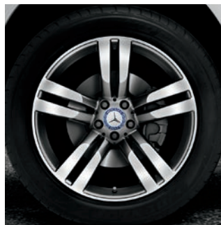
20" twin 5-spoke (Appearance Package)