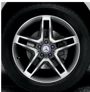
20" AMG twin 5-spoke (AMG Styling Package)