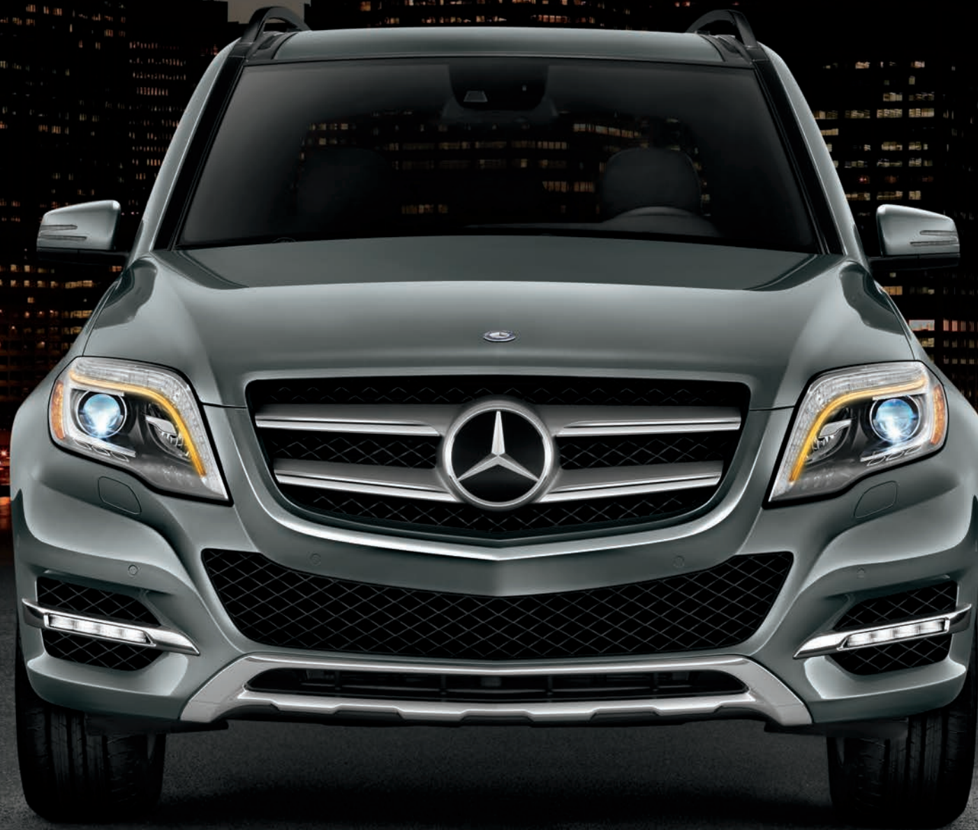
GLK350 shown above with optional Steel Grey metallic paint, PARKTRONIC and Lighting Package. GLK350 shown at left with Mocha interior and optional heated front seats, KEYLESS-GO, and Leather, Multimedia and Premium 1 Packages. Please see endnotes at back of brochure.