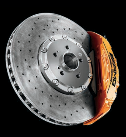
AMG Ceramic Compound Braking System. Bronze calipers identify the ultimate performance of carbon-fiber-reinforced ceramic brake discs. Harder, longer-wearing, and more fade-resistant, they're well-suited to the demands of the track. Even with larger 15.8" front discs, the hardware is 40% lighter overall—reducing unsprung mass.