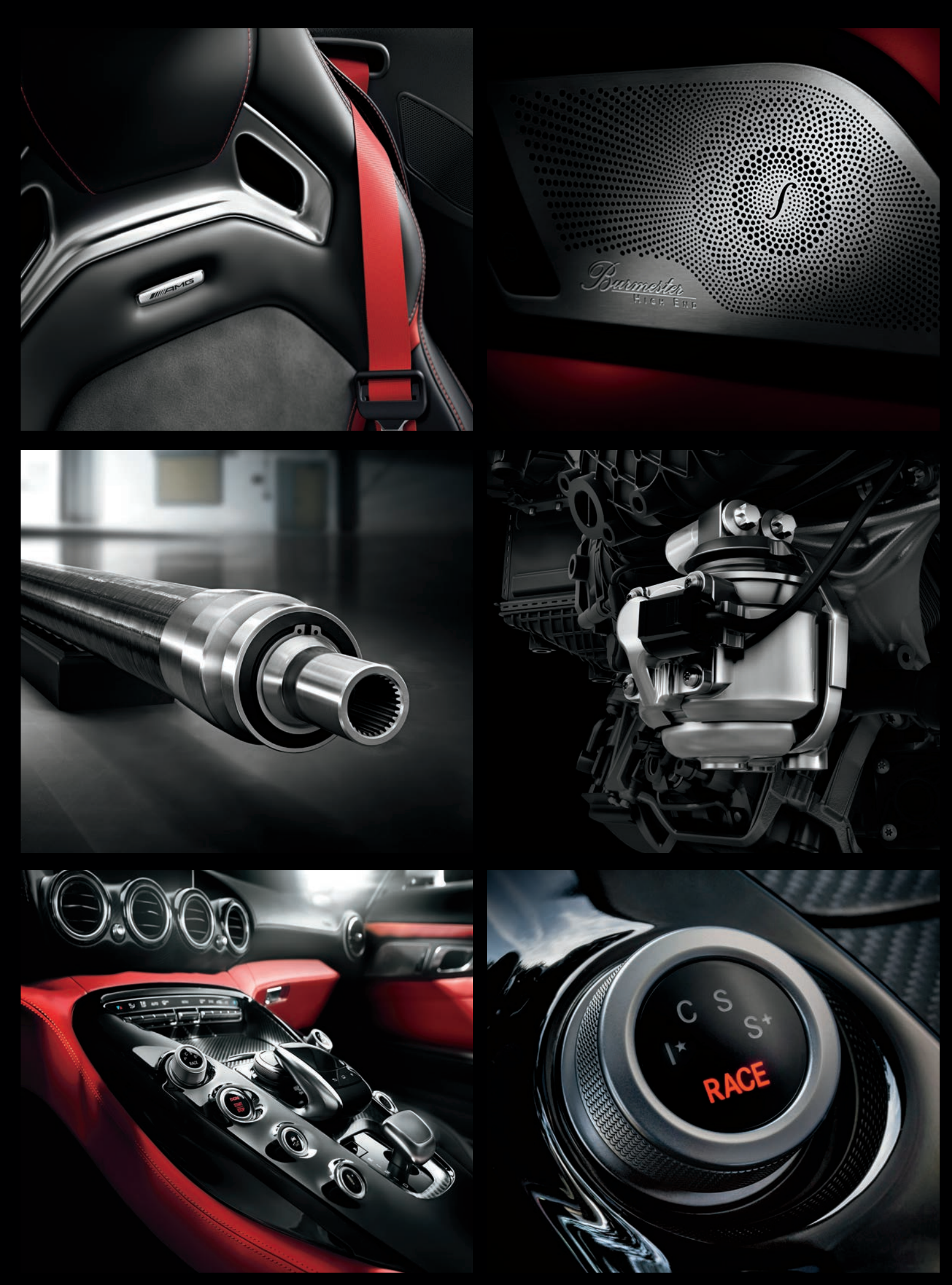
\ensuremath{^{\star}}\xspace Optional or not available on some models. Please see back of brochure.