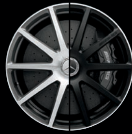
WHEEL: 20" AMG forged 10-spoke Silver or Black O AMG $63 A AMG $65