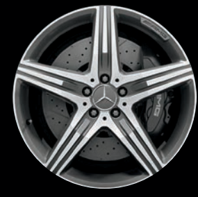
WHEEL: 20" AMG 5-spoke • AMG S 63