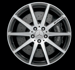
WHEEL: 19" AMG 10-spoke △ AMG S 63

WHEEL: 20" AMG forged multispoke • AMG $65