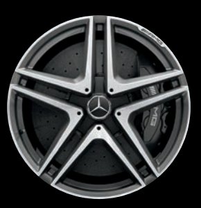
WHEEL: 20" AMG twin 5-spoke \triangle AMG $65