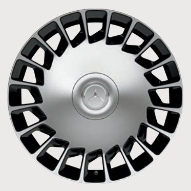
20" Maybach Exclusive forged ○ $560, $650