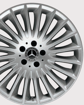
19" multispoke ∆ S 560, S 650