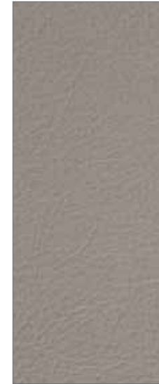
Medium Light Stone Leather 1