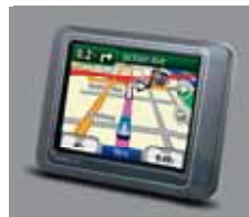
Garmin® portable navigation systems 1