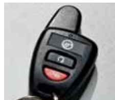
Remote start systems

To learn more about Mercury Custom Accessories and to buy them online, visit mercuryaccessories.com .