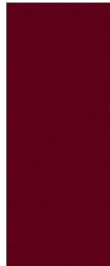
Dark Toreador Red Metallic