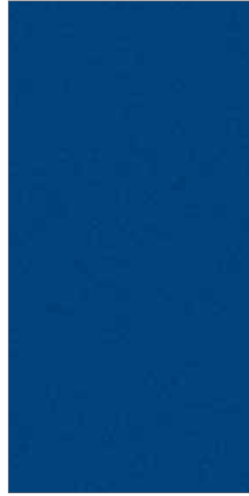
Blue Flame Metallic 1, 2