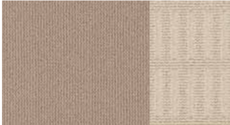
Camel Cloth with Sand Inserts