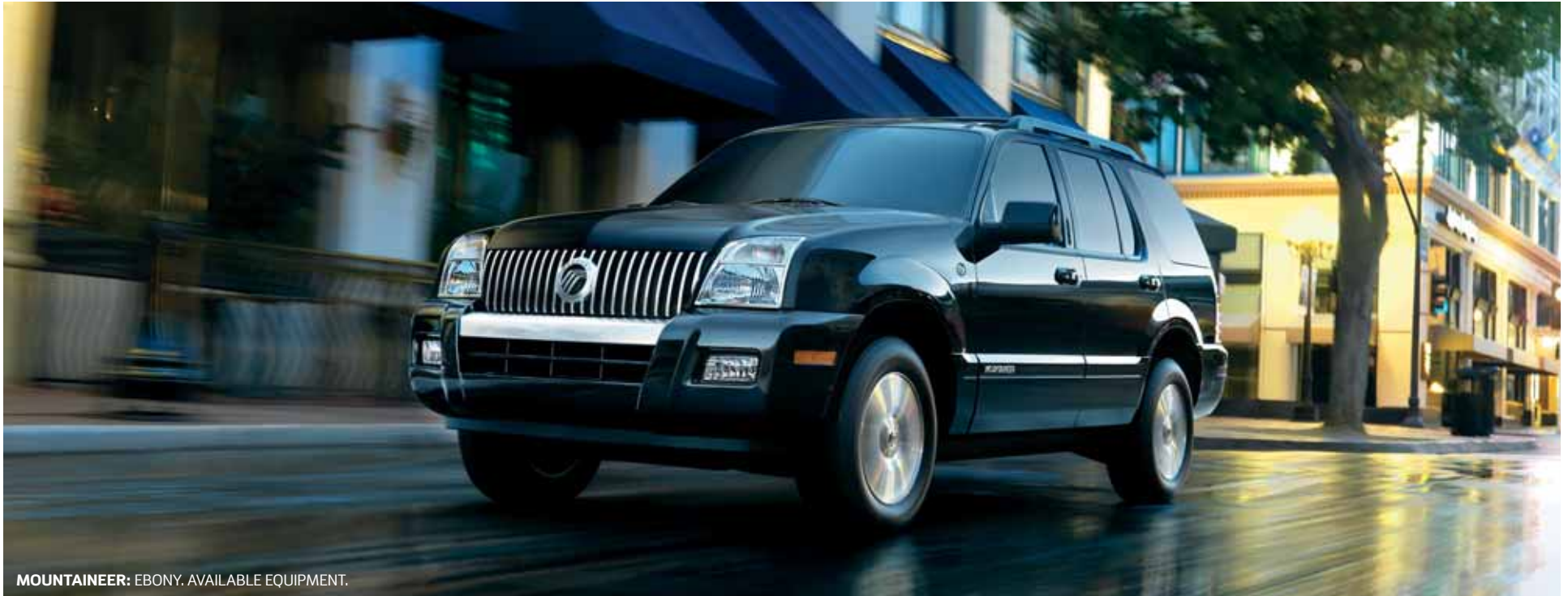
MOUNTAINEER: EBONY. AVAILABLE EQUIPMENT.