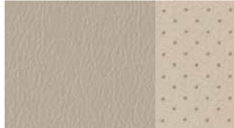
Camel Leather with Sand Perforated Leather Inserts 1