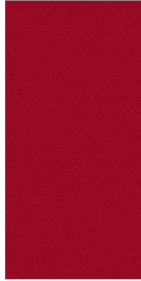
Sangria Red Metallic 1, 2