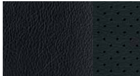
Charcoal Black Leather with Perforated Leather Inserts 1