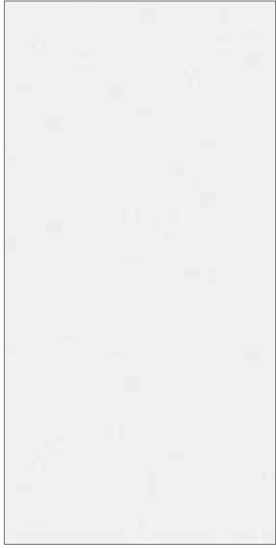
White Platinum Metallic Tri-Coat 1, 2