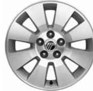
17" MACHINED-ALUMINUM WHEELS Standard on Mountaineer