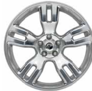
20" POLISHED-ALUMINUM WHEELS Available on Premier