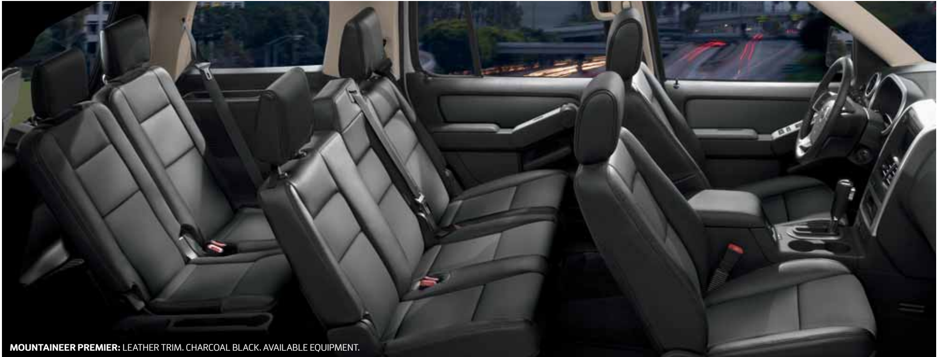
MOUNTAINEER PREMIER: LEATHER TRIM. CHARCOAL BLACK. AVAILABLE EQUIPMENT.