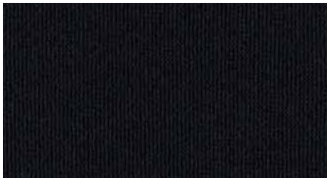
Charcoal Black Cloth