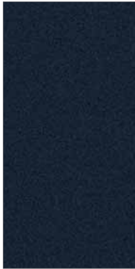
Black Pearl Slate Metallic 1, 2