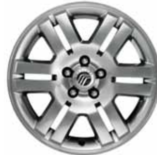
18" SATIN-ALUMINUM CHROME-CLAD WHEELS Standard on Premier