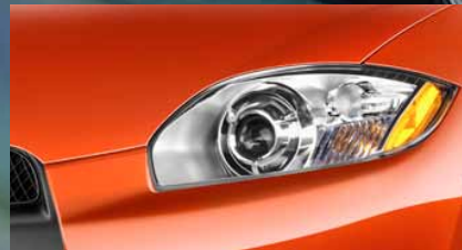
HID Projector-type Headlamps