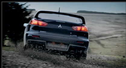
Super All-Wheel Control (S-AWC)