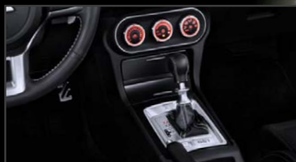
Available Twin Clutch SST