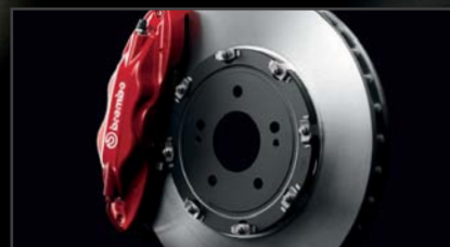
Brembo® Braking System