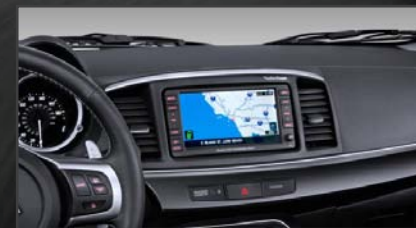
40GB Navigation System with Music Server & Real-Time Traffic