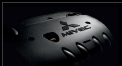
291-hp Intercooled MIVEC Turbo Engine