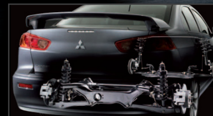
Available Eibach® and BILSTEIN® Suspension