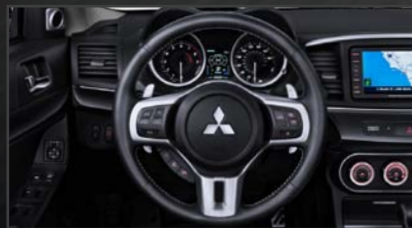
FUSE Hands-Free Link System™