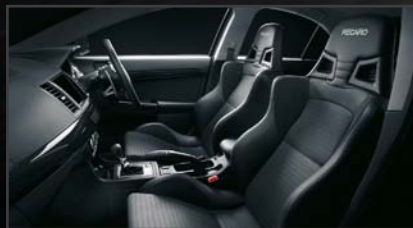
RECARO® Sport Seats