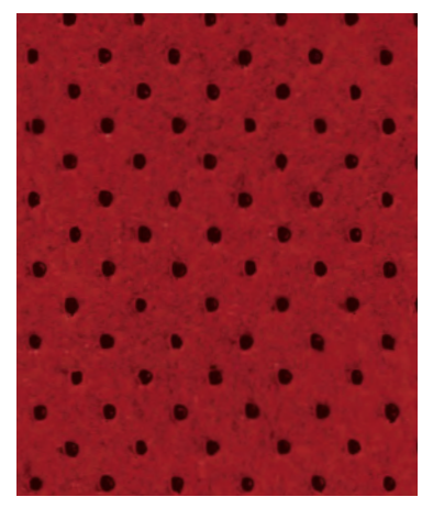
Black Leather/Red Alcantara® Inserts NISMO