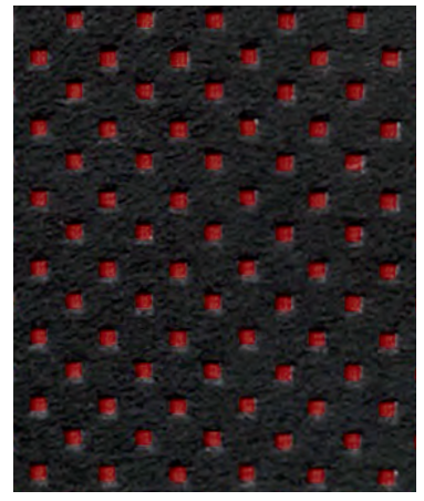
50th Anniversary Leather 50TH ANNIVERSARY EDITION