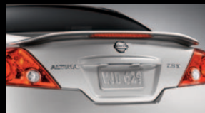
Rear Decklid Spoiler

For more information on the complete line of Genuine Nissan Accessories, go to NissanUSA.com/accessories . Or shop online at the Nissan eStore.