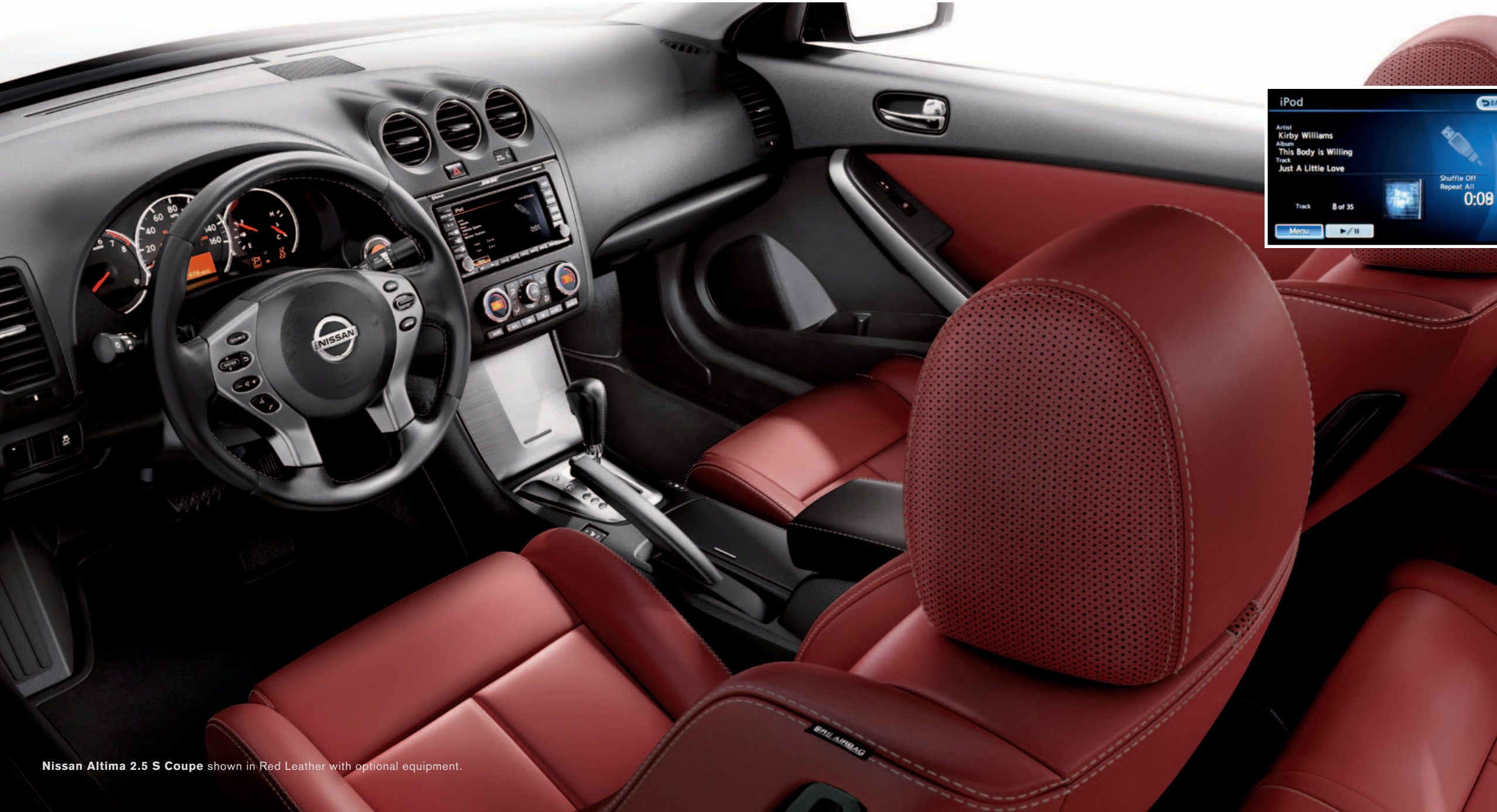
Nissan Altima 2.5 S Coupe shown in Red Leather with optional equipment.

From perfectly placed controls to body-hugging bucket seats, your Altima Coupe's interior puts you at the center of everything. While advanced technologies keep you in touch and entertained through every thrilling mile.