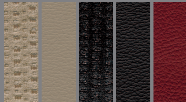
Blond Cloth Blond Leather Charcoal Cloth Charcoal Leather Red Leather