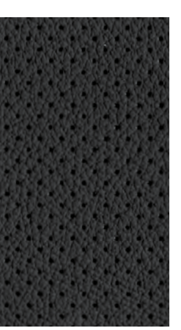
Charcoal Leather 2.5 SL | 3.5 SL