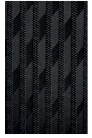
Charcoal Cloth 2.5 | 2.5 S | 2.5 SV