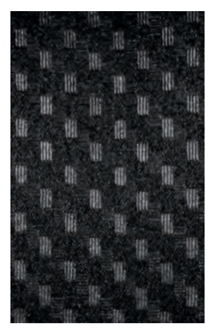
Charcoal Sport Cloth 2.5 SR | 3.5 SR