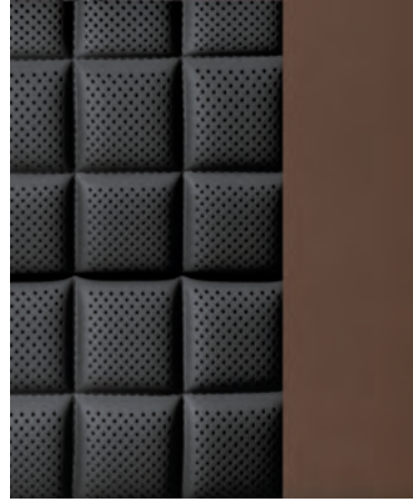
Premium Black/Brown Leather Platinum Reserve