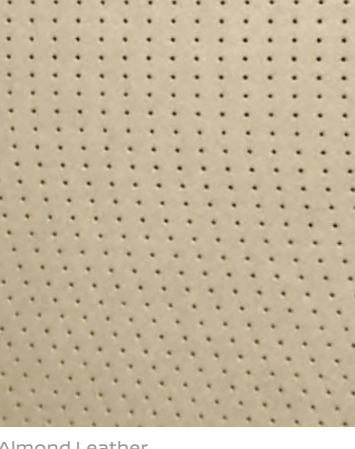
Almond Leather SL | Platinum