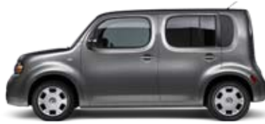
1.8 S: ADD IN EXTRA AMENITIES.