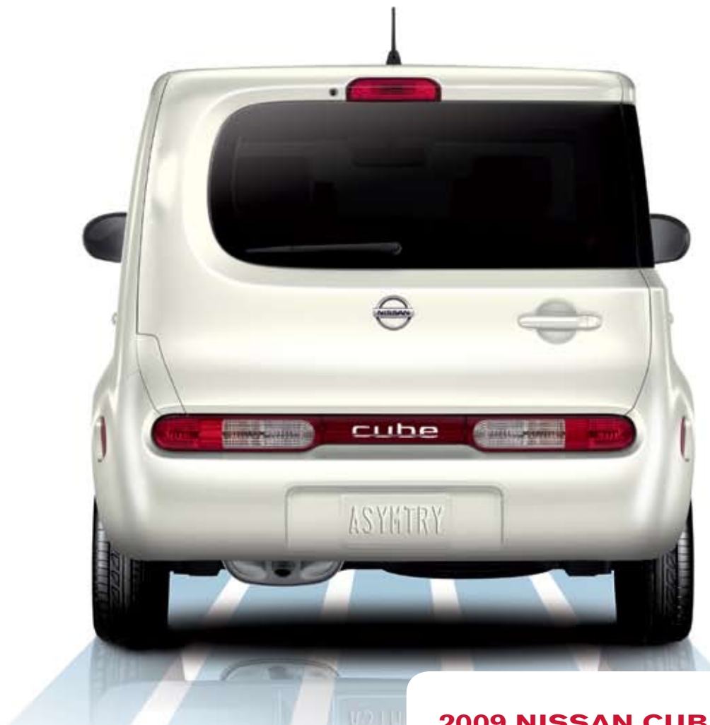
cube® 1.8 SL in Pearl White.