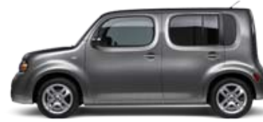
1.8 SL: IT'S YOUR MOBILE DEVICE.