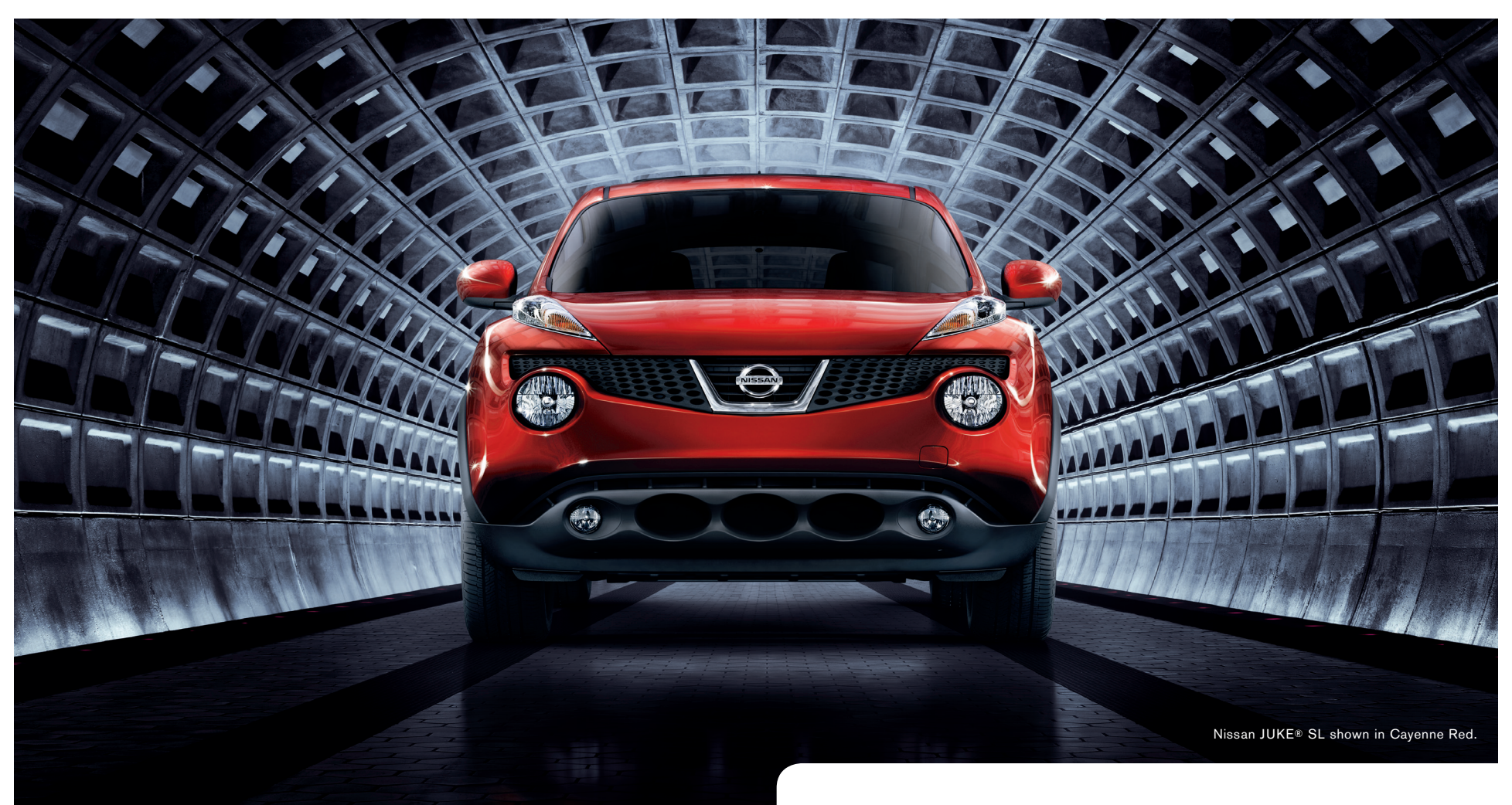
PRINTED EXCLUSIVELY FOR