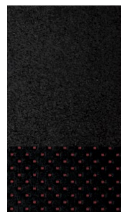
NISMO<sup>®</sup> Black/Red Cloth with Smoked Gray Trim