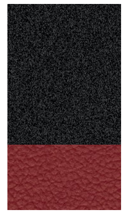
Recaro<sup>®</sup> Black/Red Leather/Synthetic Suede with Smoked Gray Trim