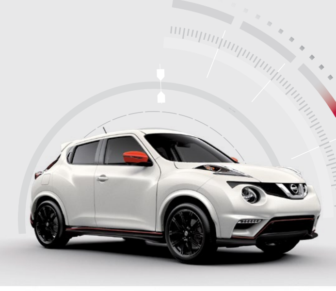
registered trademark of Rockford Corporation.