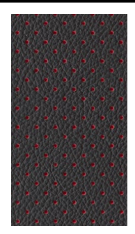
Black/Red Leather with Silver or Red Trim