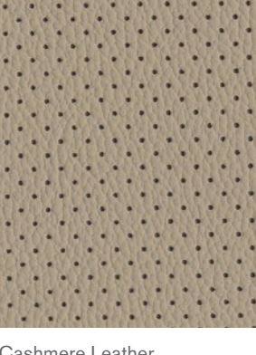
Cashmere Leather SL | PLATINUM