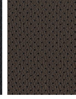
Mocha Leather SL | PLATINUM