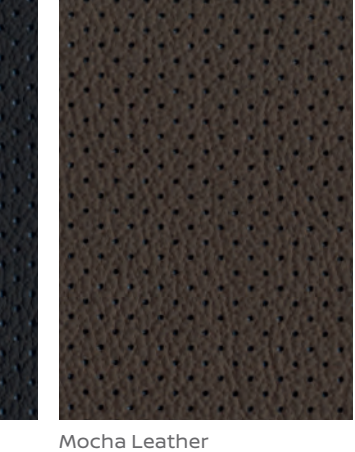
SL | PLATINUM