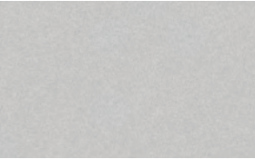
Brilliant Silver K23 S | SV | SL