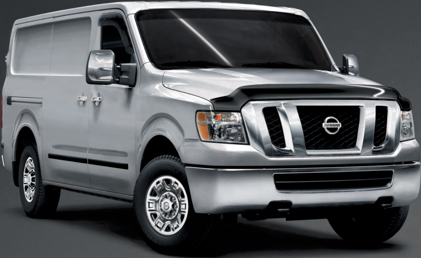
Nissan NV3500® HD SL Cargo Standard Roof shown in Brilliant Silver with Hood Protector, Telescoping Tow Mirrors, Tow Hooks, Side-window Deflectors, Body Side Moldings, and Splash Guards.

For more information and to shop online for NV® Cargo Genuine Nissan Accessories, go to bit.ly/18nvcargo-estore