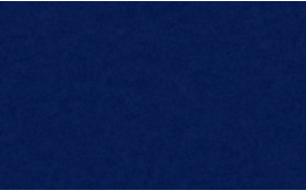
Arctic Blue Metallic RBG SV | SL