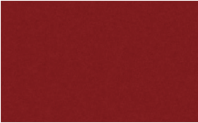
Cayenne Red NAH SV | SL