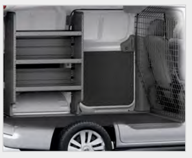
2. Base AD Series Package Includes one AD Series shelf and wire partition MSRP:<sup>2</sup> $710 Customer Responsibility: $0