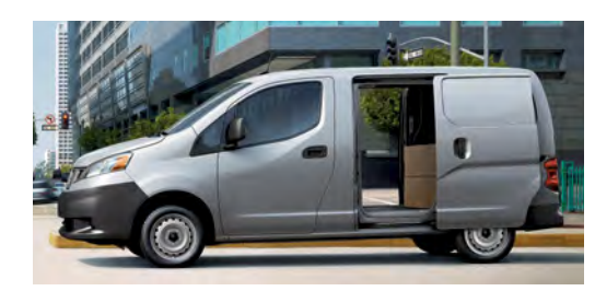
Dual sliding side doors provide easy access in tight situations.

With Nissan Upfit Engineering, NV200® Compact Cargo has been designed to let you create a commercial vehicle that is small on the outside, but creates lots of room on the inside. From flat wheel wells to a fold-down passenger seat, every available inch is ready to work – it can easily carry a 40" x 48" pallet. And with integrated reinforced cargo-mounting points and integrated roof-mounting points, the NV200® Compact Cargo is an upfitter-friendly base to build your business on.