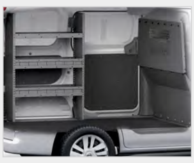
3. Base HD Series Package Includes one HD Series shelf and steel partition MSRP:<sup>2</sup> $950 Customer Responsibility: $0