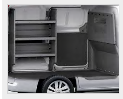
Base AD Series Package Includes one AD Series shelf and steel partition MSRP:<sup>2</sup> $900 Customer Responsibility: $0

The Nissan Commercial Vehicle Incentive Program makes it easy for qualifying NV200® Compact Cargo buyers to enhance their purchase by taking advantage of one of seven exciting complimentary choices.