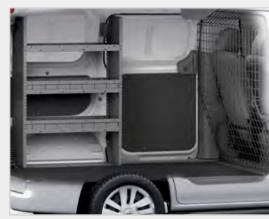
4. Base HD Series Package Includes one HD Series shelf and wire partition MSRP:<sup>2</sup> $760 Customer Responsibility: $0