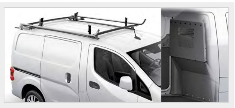
5. Grip Lock Ladder Rack Package Includes double grip lock ladder rack and steel partition MSRP:<sup>2</sup> $1,600 - Customer Responsibility: $600