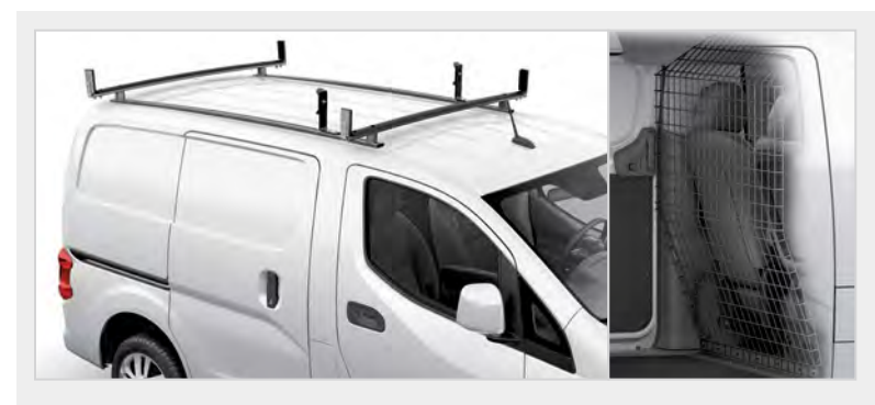
5. Complimentary Utility Package 2-bar ladder rack and wire partition MSRP:<sup>2</sup> $810 Customer Responsibility: $0