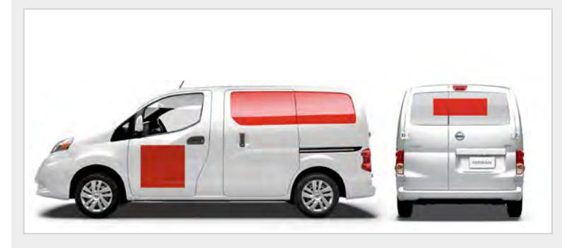
6. Complimentary NCV Graphics Package³ Package includes 40 square feet of custom-designed, professionally installed graphics by 3M.® MSRP:² $750 Customer Responsibility: $0