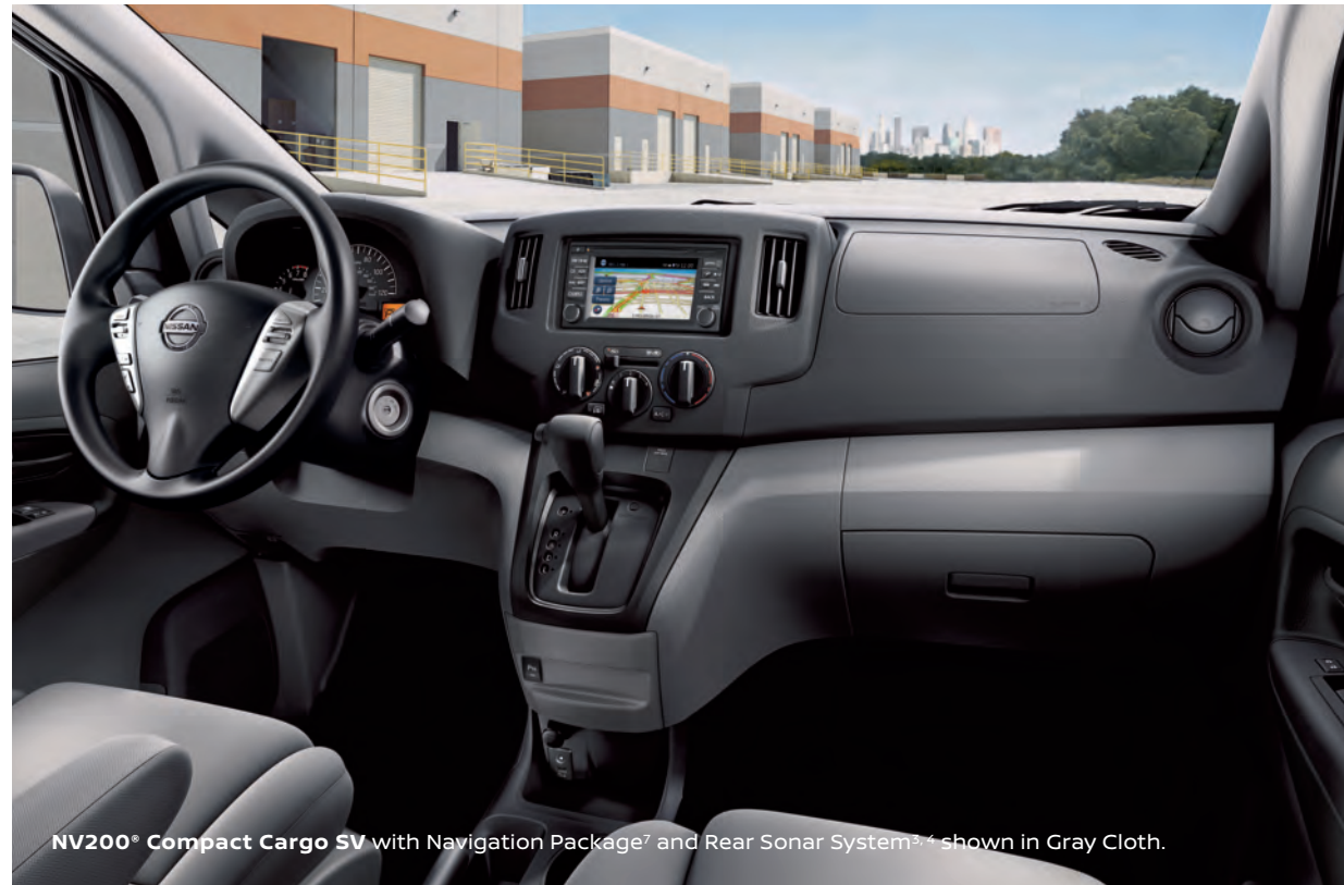
NV200® Compact Cargo SV with Navigation Package 7 and Rear Sonar System 3,4 shown in Gray Cloth.