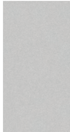
Brilliant Silver Metallic S|SV