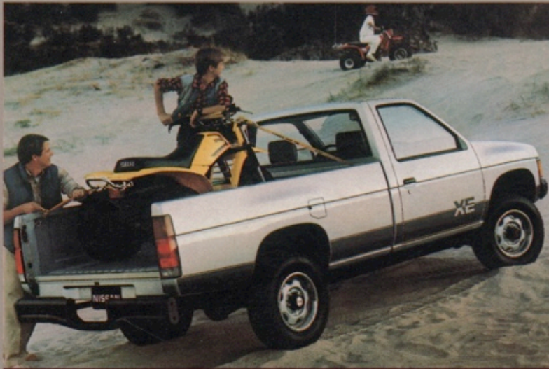
NISSAN XE LONG BED 4x4

• Sport Package on SE) with power windows, power door locks, cruise control, variable intermittent wipers, dual power side mirrors and 4-speaker stereo radio with cassette deck • Optional Sport Package (available with Power Package on SE) with alloy wheels, pop-up sunroof, 31x10.50R15 tires and fender flares.