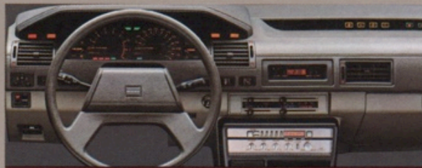
NISSAN 200 SX TURBO INSTRUMENT PANEL