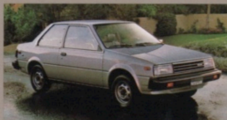
NISSAN SENTRA STANDARD 2-DOOR SEDAN