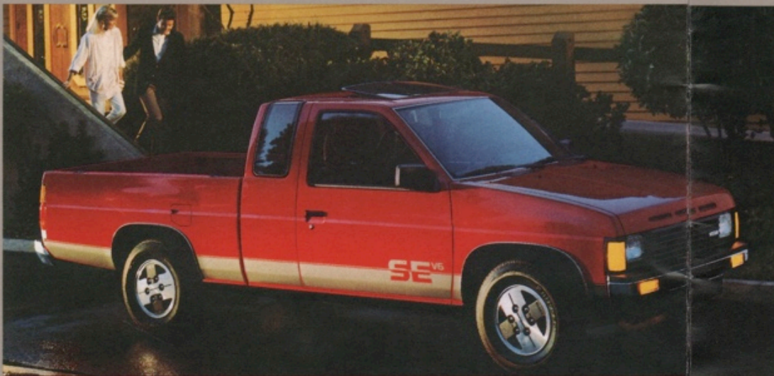
NISSAN SE KING CAB

• 4-passenger seating in King Cab® with hideaway jump seats (SE and XE) • New wrapover quarter windows • Sliding rear window (SE) • Pop-up tie-down hooks (SE) • Removable tailgate with quick release • Optional pop-up sunroof (SE with Sport Package and Power Package)