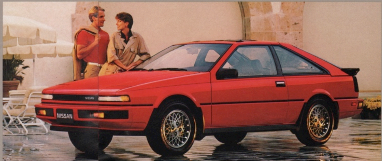
NISSAN 200 SX TURBO