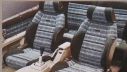
NISSAN 200 SX TURBO INTERIOR