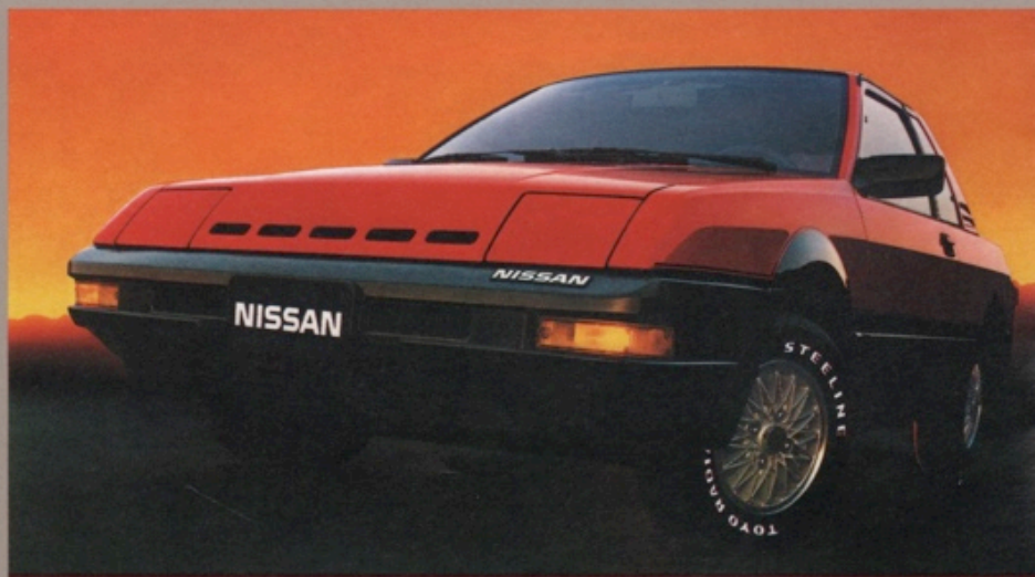
NISSAN PULSAR NX