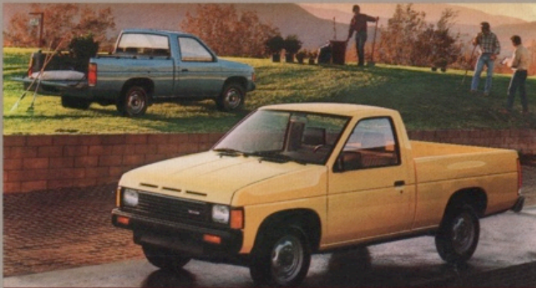
(TOP) NISSAN E REGULAR BED, (BOTTOM) NISSAN STANDARD REGULAR BED