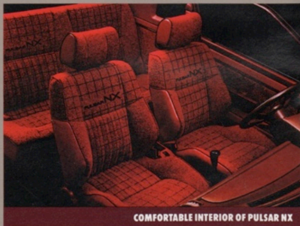
COMFORTABLE INTERIOR OF PULSAR NX

*Nissan Pulsar NX with 5-Speed: 38 EST HWY/31 EST CITY Nissan Pulsar NX with Automatic: 30 EST HWY/27 EST CITY 1986 E.P.A. estimates. Remember use these E.P.A. estimates for comparison. Actual mileage may vary depending upon driving conditions. Some items shown are optional. See the 1986 Nissan Pulsar NX brochure for more complete information.