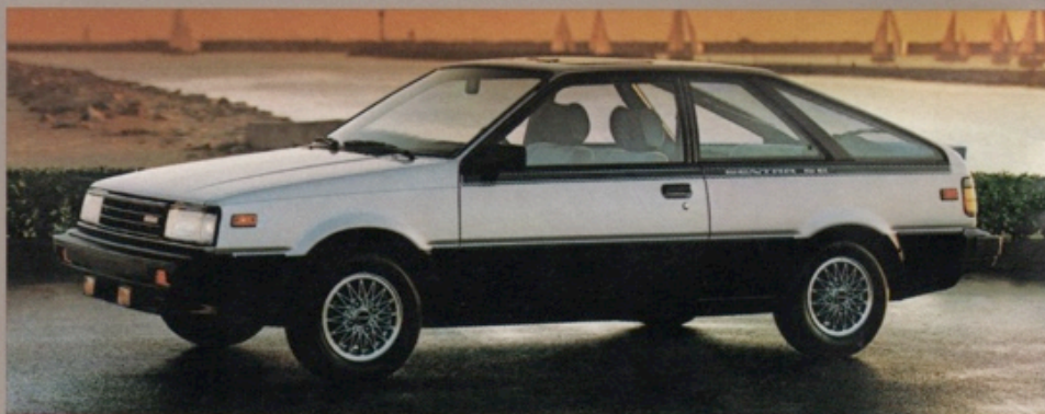
NISSAN SENTRA SE HATCHBACK COUPE