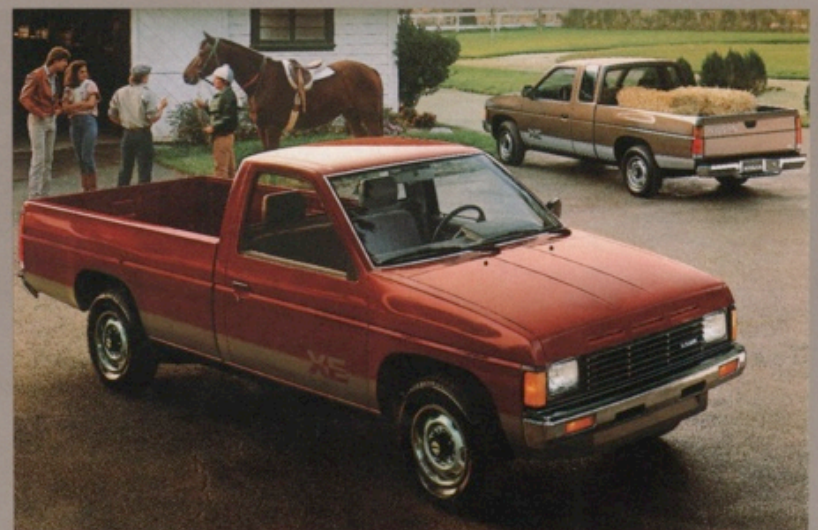
(TOP) NISSAN XE KING CAB, (BOTTOM) NISSAN XE LONG BED