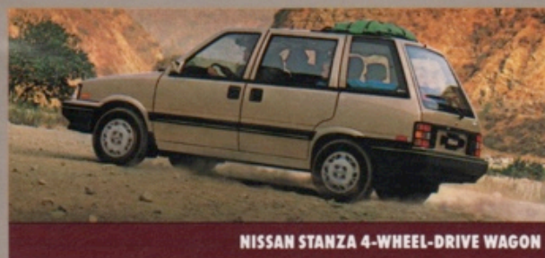
NISSAN STANZA 4-WHEEL-DRIVE WAGON