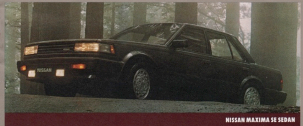
NISSAN MAXIMA SE SEDAN

Some items shown are optional. See the 1986 Nissan Maxima brochure for more complete information.