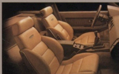
NISSAN 300 ZX OPTIONAL LEATHER INTERIOR