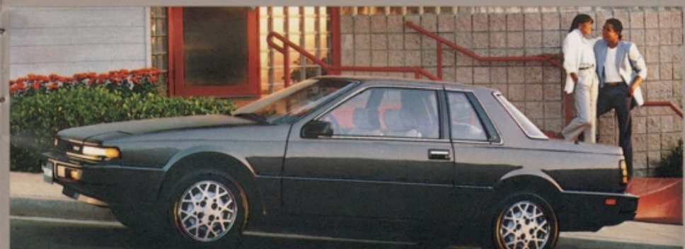
NISSAN 200 SX XE NOTCHBACK