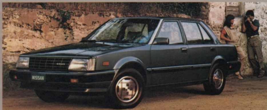
NISSAN STANZA GL SEDAN

So stretch out in style with Stanza. It won't stretch your budget.