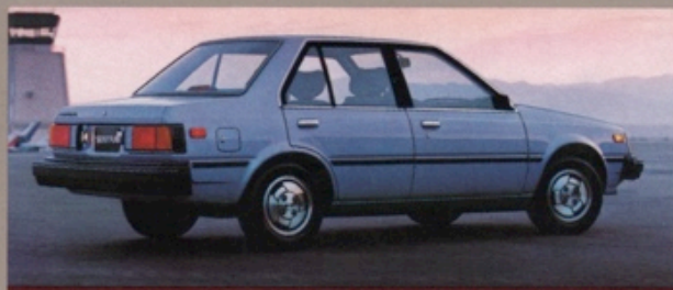
NISSAN SENTRA XE 4-DOOR SEDAN

*Nissan Sentra with 5-Speed: 38 EST HWY/31 EST CITY Nissan Sentra with Automatic: 30 EST HWY/27 EST CITY 1986 E.P.A. estimates. Remember use these E.P.A. estimates for comparison. Actual mileage may vary depending upon driving conditions.