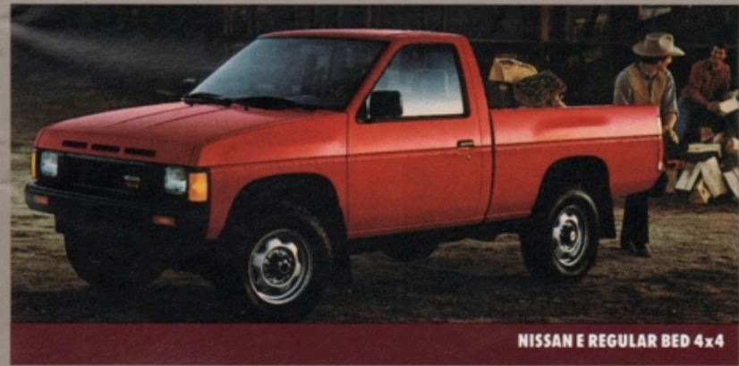
NISSAN E REGULAR BED 4x4