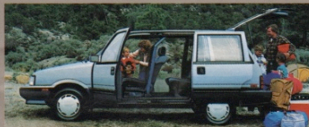
NISSAN STANZA 2-WHEEL-DRIVE WAGON