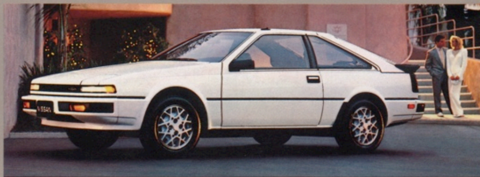
NISSAN 200 SX XE HATCHBACK