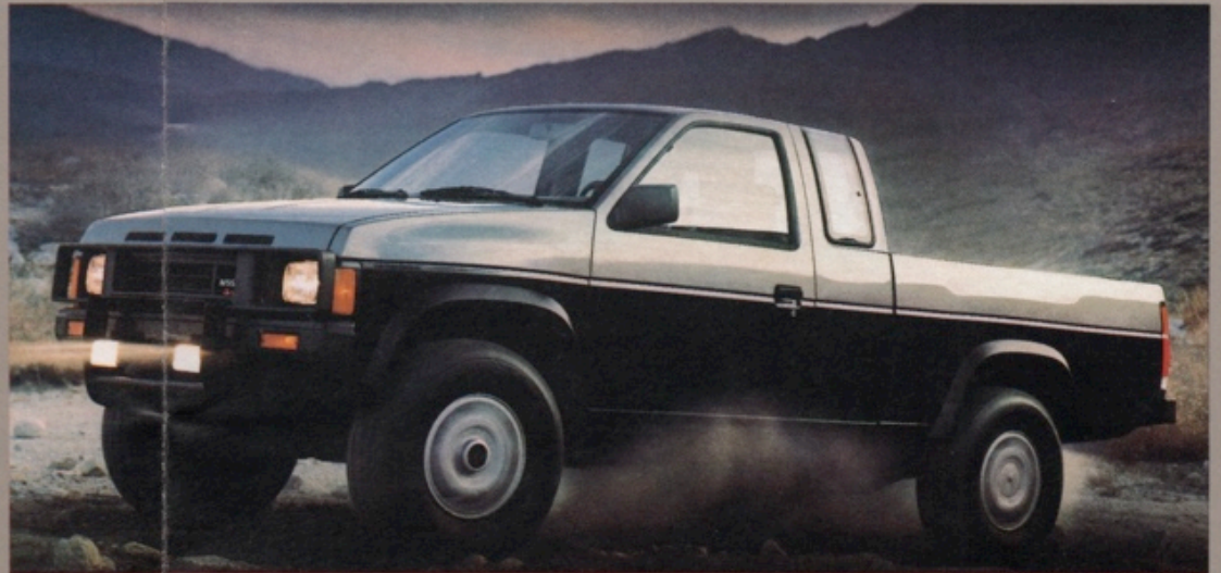
NISSAN SE KING CAB 4x4