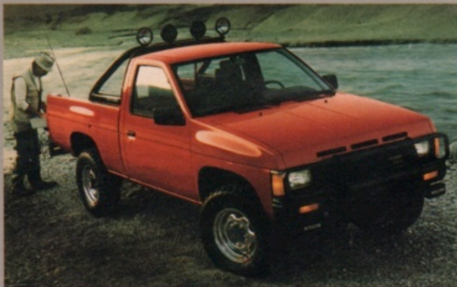
NISSAN SE REGULAR BED 4x4