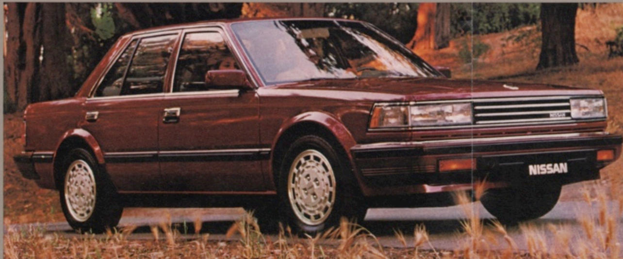
NISSAN MAXIMA GL SEDAN