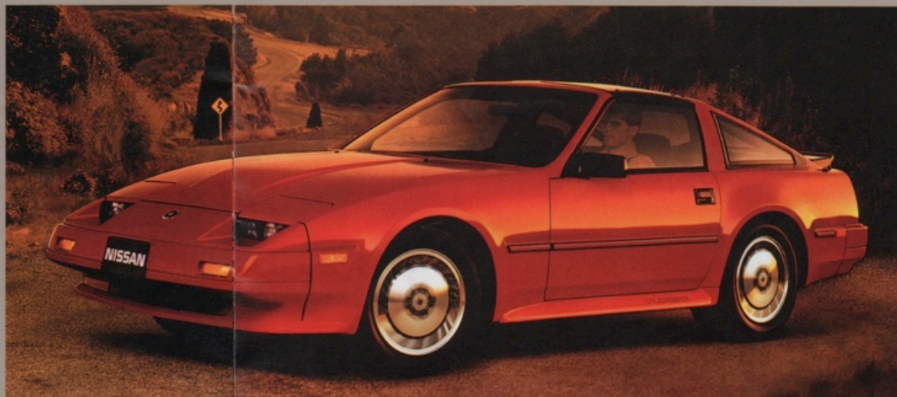
NISSAN 300 ZX TURBO