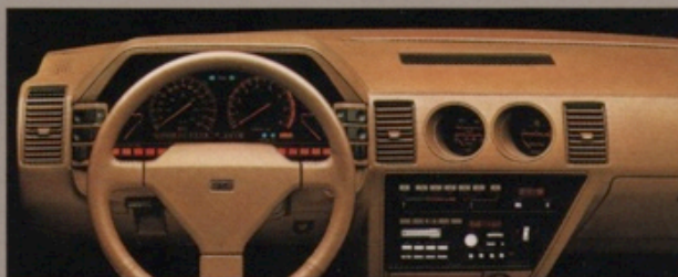
NISSAN 300 ZX ANALOG INSTRUMENT PANEL

• 4-wheel independent suspension • Optional Leather Package • Optional Electronic Equipment Package with 80-watt AM/FM stereo, graphic equalizer and microprocessor-controlled automatic air conditioning • 3-way driver-adjustable shock absorbers (Turbo) . . . and much, much more.