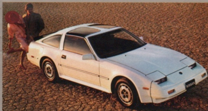
NISSAN 300 ZX 2+2