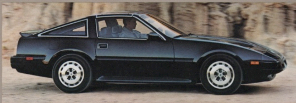
NISSAN 300 ZX 2-SEATER