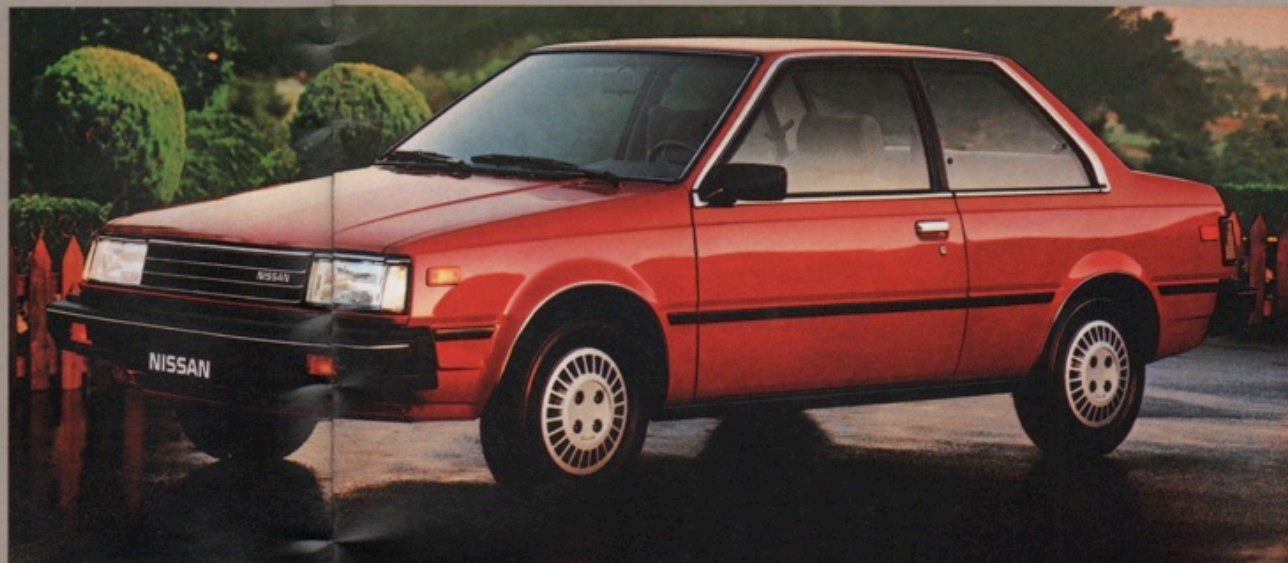
NISSAN SENTRA XE 2-DOOR SEDAN