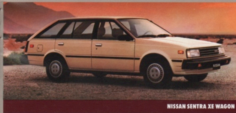
NISSAN SENTRA XE WAGON

Some items shown are optional. See the 1986 Nissan Sentra brochure for more complete information.