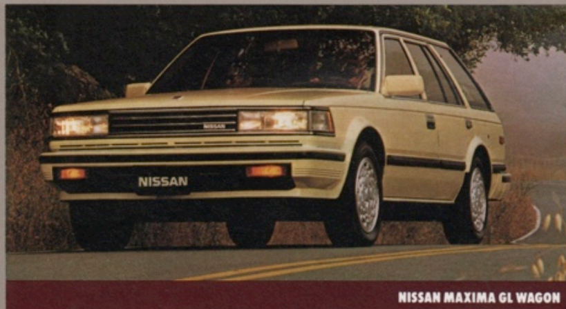
NISSAN MAXIMA GL WAGON

Nissan Maxima combines a fuel-injected, 3.0-liter V6 engine with features like front-wheel drive and power rack-and-pinion steering to give you a smooth ride and better handling.