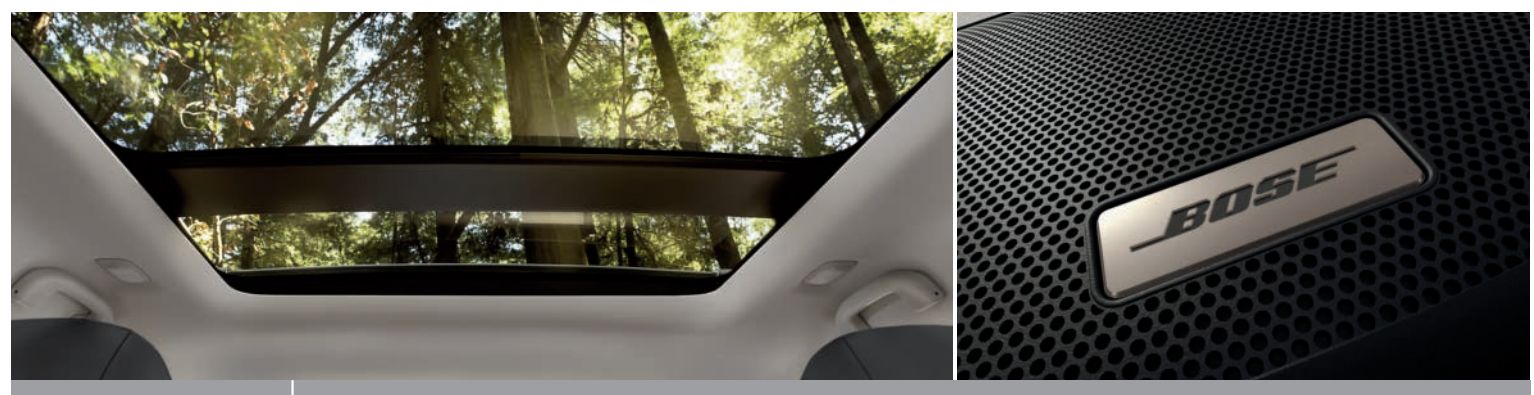
PREMIUM PACKAGE SL ROCK CREEK EDITION