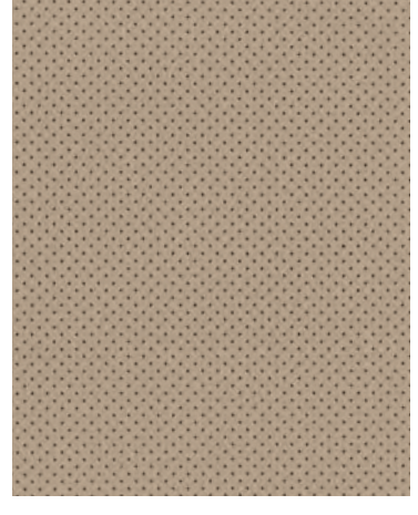
Beige Cloth SV