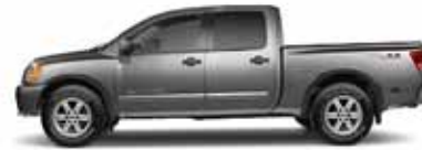
PRO-4X KING CAB AND CREW CAB