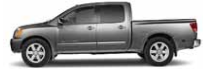
SL CREW CAB