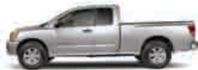
SV KING CAB AND CREW CAB