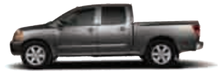
SL CREW CAB