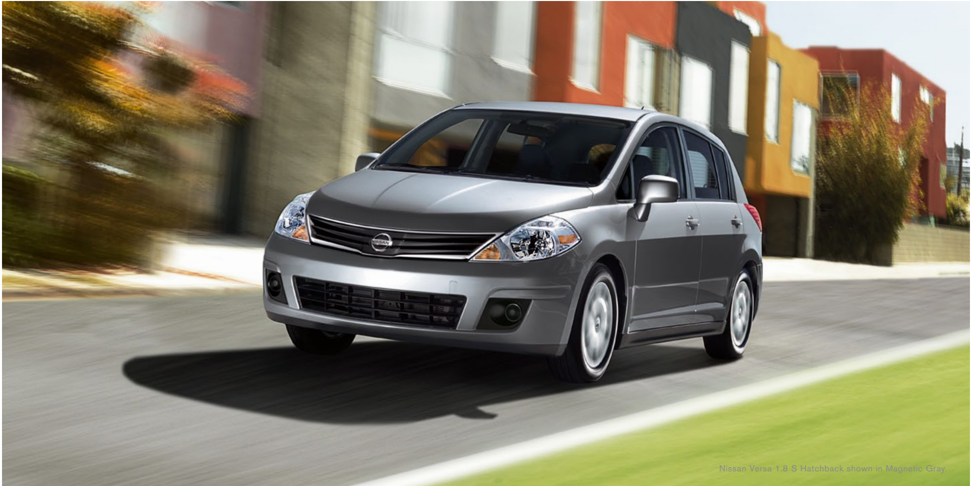
Nissan Versa 1.8 S Hatchback shown in Magnetic Gray.