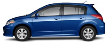
1.8 SL: ADDS UNEXPECTED FEATURES