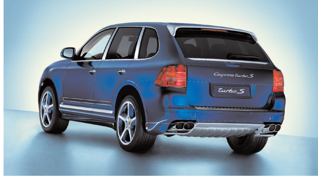
Rear view with SportDesign pack and 20-inch Cayenne SportTechno wheels in exterior colour