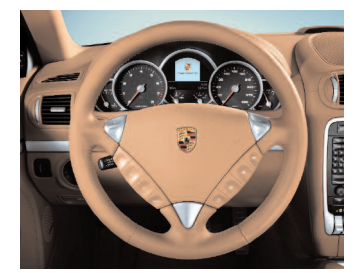
Three-spoke multifunction steering wheel in padded leather