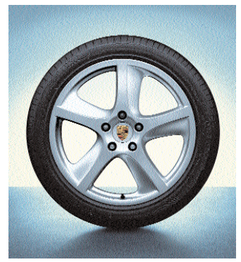
20-inch Cayenne SportTechno wheel