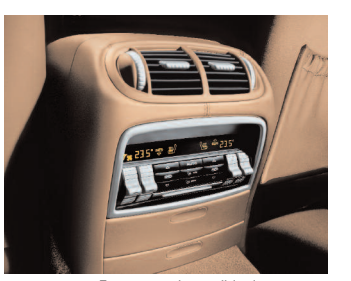
Four-zone air-conditioning system