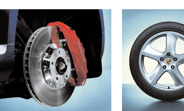
Brake disc and caliper

Another special feature on the Cayenne Turbo S is the uprated brake performance. The front wheels are fitted with six-piston monobloc aluminium calipers and internally vented, two-piece discs. The discs are larger than those on the Cayenne Turbo, measuring 380 mm in diameter and 38 mm in thickness, up from 350 mm and 34 mm, respectively.