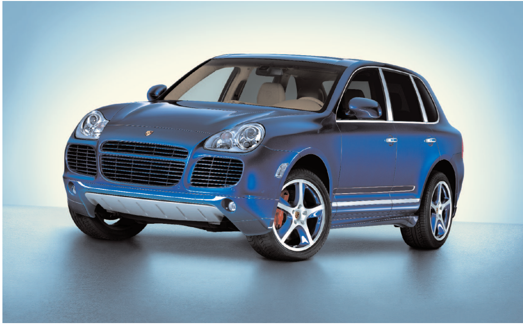
Front view with SportDesign pack and 20-inch Cayenne SportTechno wheels in exterior colour