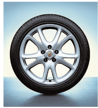
20-inch Cayenne SportDesign wheel