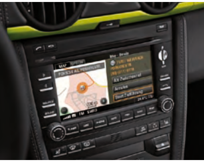
Porsche Communication Management (PCM) including navigation module