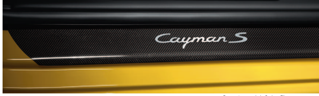
Door-entry guards in Carbon Fiber