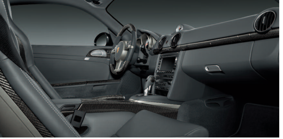
Interior: Carbon Fiber