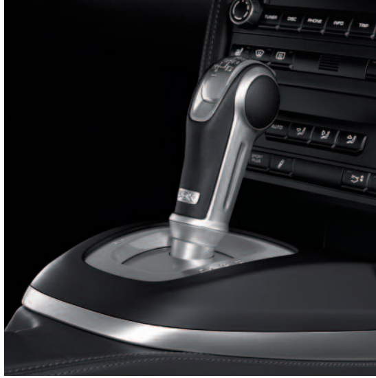
Gear lever trim in Aluminum-Look, PDK selector in Aluminum