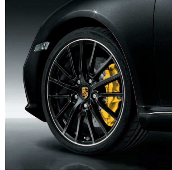
Wheels painted in different exterior color