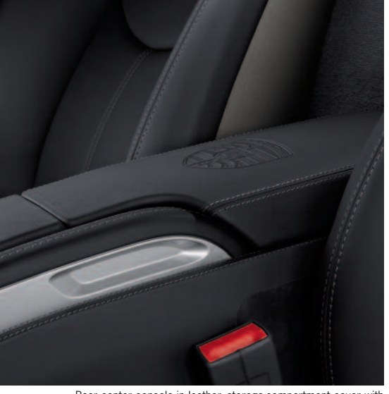
Rear center console in leather, storage-compartment cover with Porsche Crest and seat-belt buckles in leather