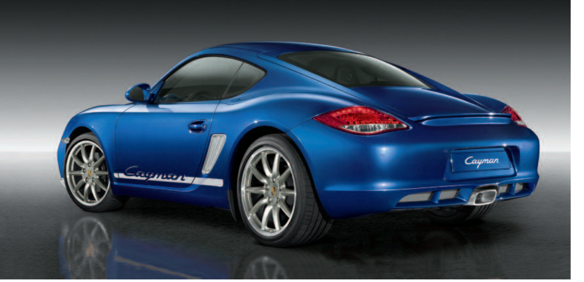
Exterior package in matte Aluminum-Look, mirror attachment-point finishers painted, rear apron grilles and side strips with model designation