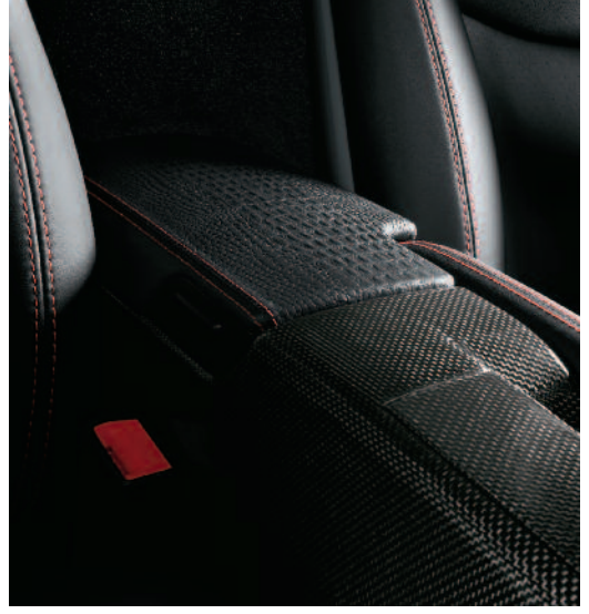
Interior package in leather with Cayman design