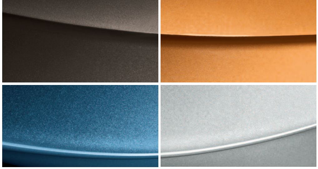
Selection of special/individual colors: Marrone Metallic, Nordic Gold Metallic, Azurro California Metallic, Polar Silver Metallic

Every component we use has been tested and approved, ensuring that your Porsche remains a Porsche, but one that embodies your personal style.