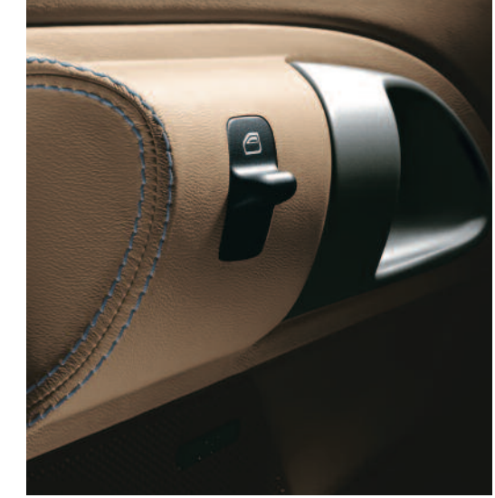
Interior leather package door-opener trim in leather