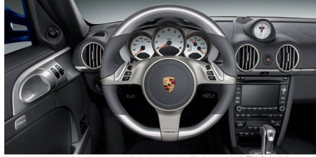
Instrument cluster-surround in Aluminum-Look, three-spoke multifunction steering wheel for PDK in Aluminum-Look, switch-panel trim strip and air vent slats in Aluminum-Look