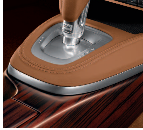
Gear lever trim in leather