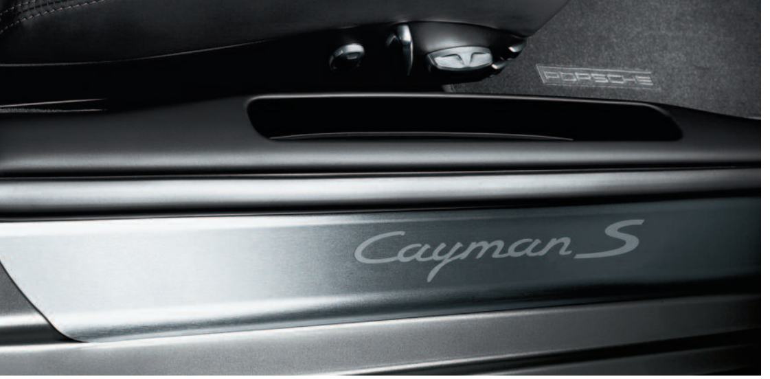
Door-entry guards in stainless steel