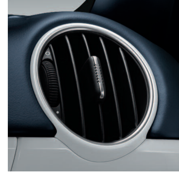
Air vents painted*