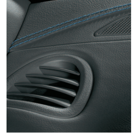
Windshield defroster panel and defroster vents in leather