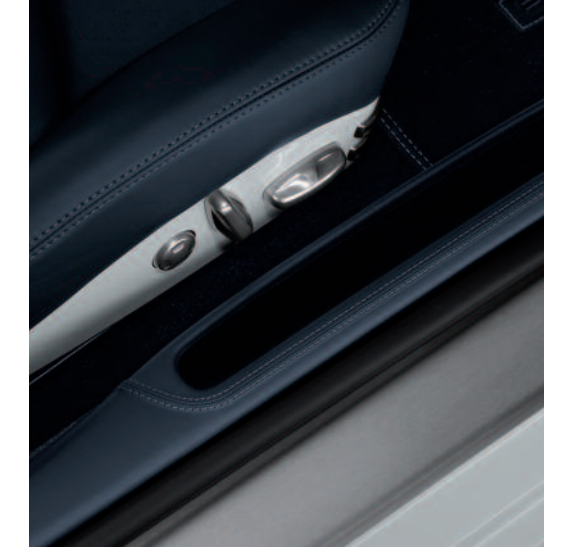
Inner door-entry guards in leather