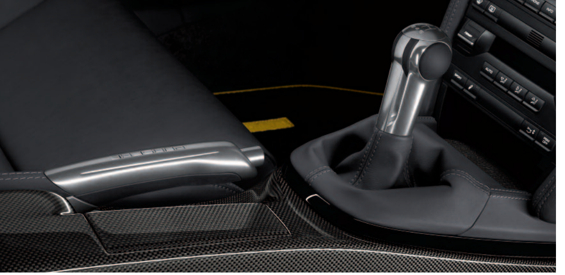
Gear/handbrake levers in Aluminum I