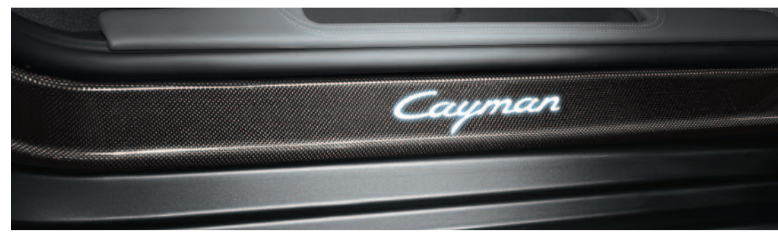
Door-entry guards in Carbon Fiber, illuminated