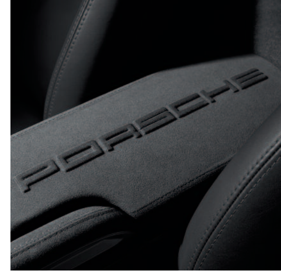
Storage-compartment cover in Alcantara® with Porsche logo