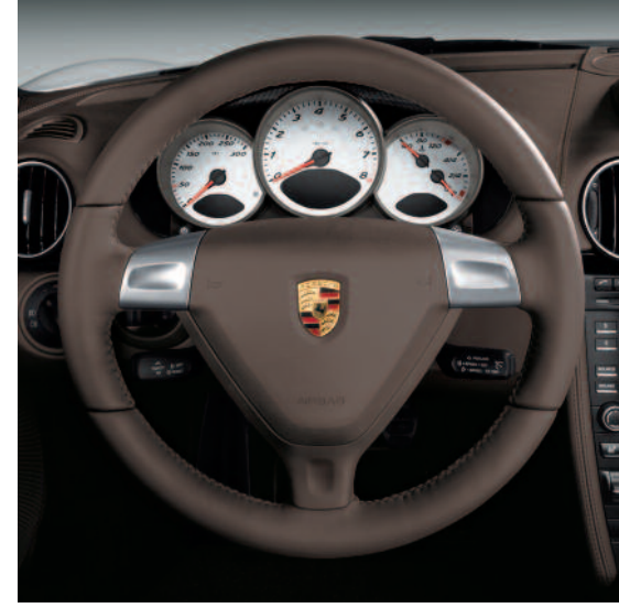
Three-spoke steering wheel in Smooth-Finish Leather, padded with Y-shaped trim in leather