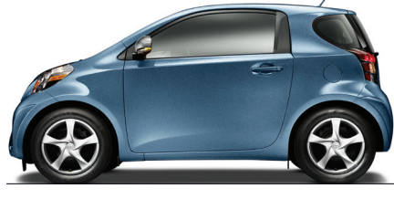
Pacific Blue Metallic