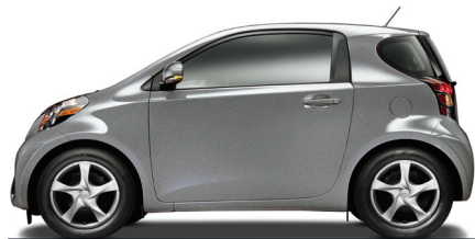
Classic Silver Metallic