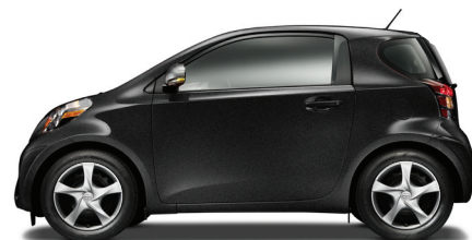
Black Sand Pearl