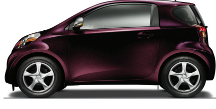
Black Currant Metallic