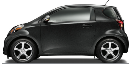
Magnetic Gray Metallic