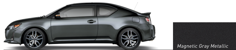
Magnetic Gray Metallic