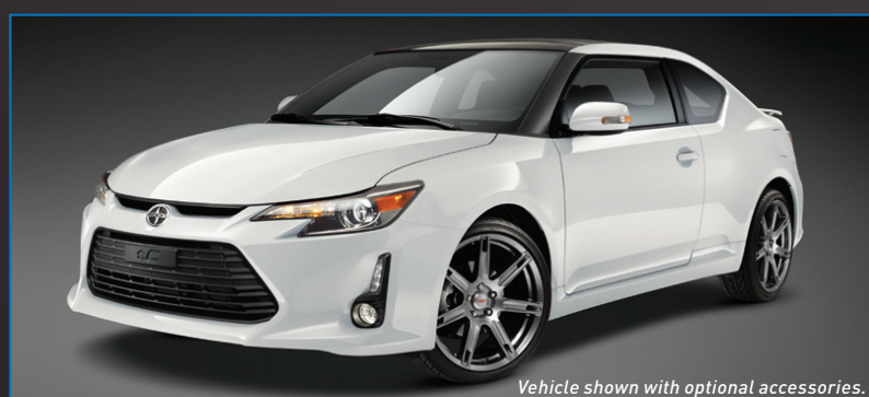
Vehicle shown with optional accessories.