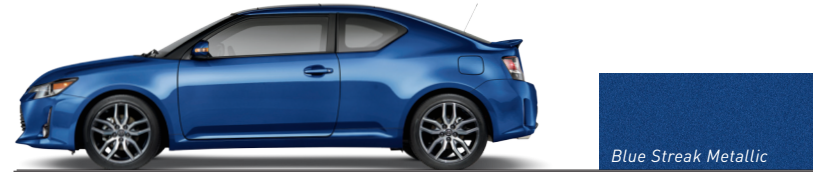
Blue Streak Metallic