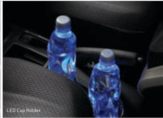
LED Cup Holder