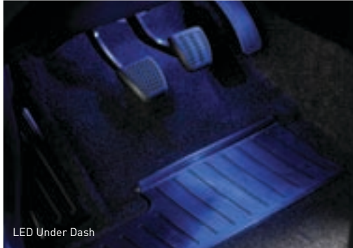
LED Under Dash