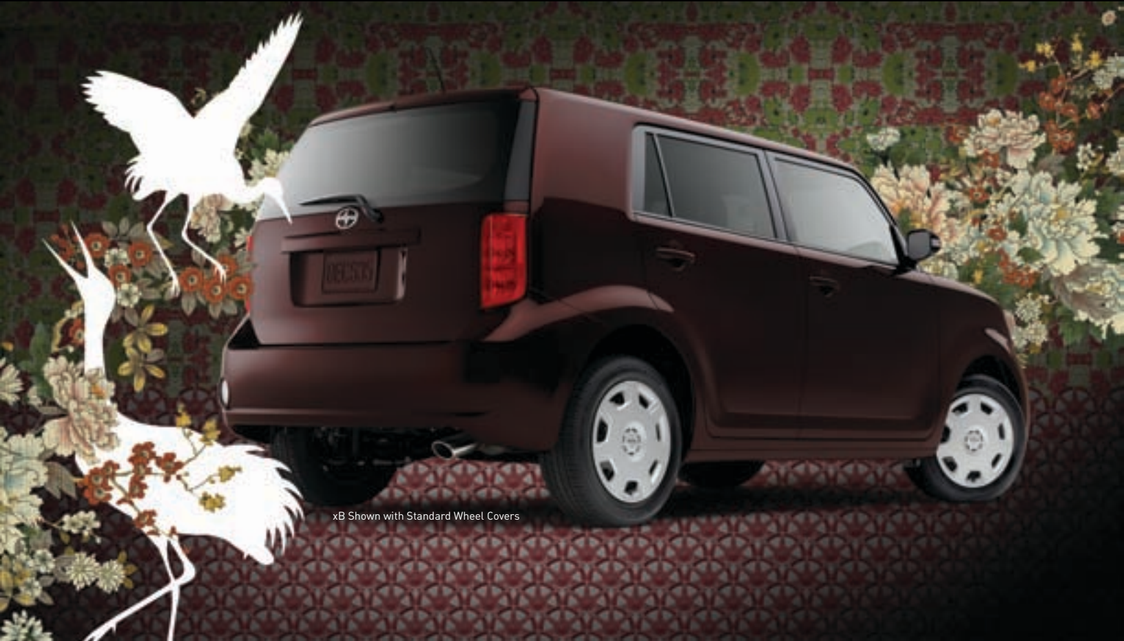
xB Shown with Standard Wheel Covers