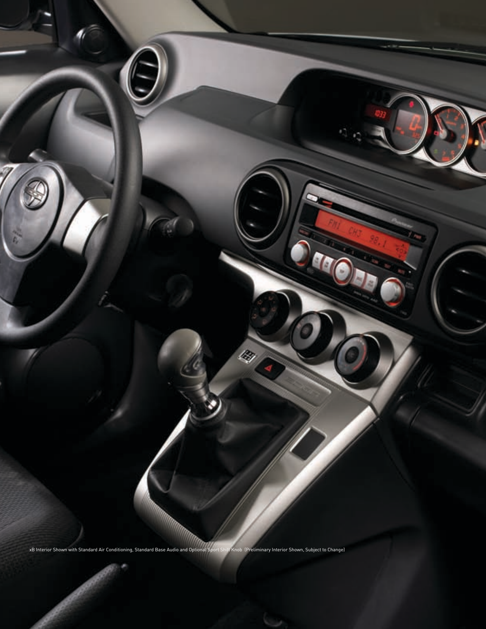
xB Interior Shown with Standard Air Conditioning, Standard Base Audio and Optional Sport Shift Knob (Preliminary Interior Shown, Subject to Change)