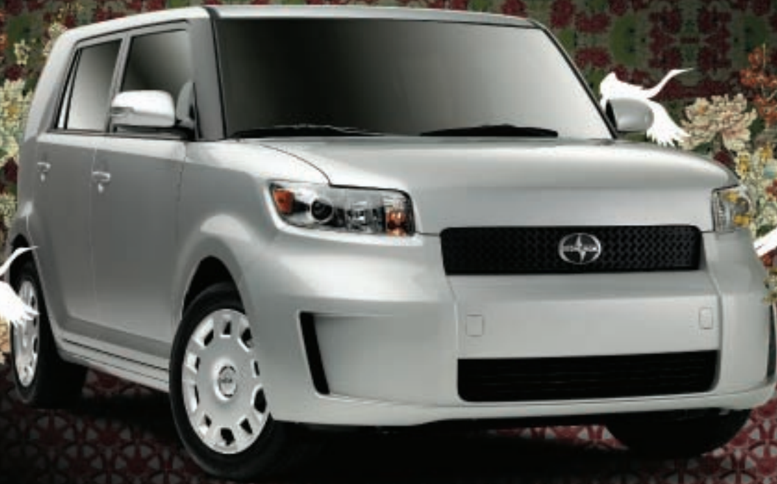
xB Shown with Standard Wheel Covers