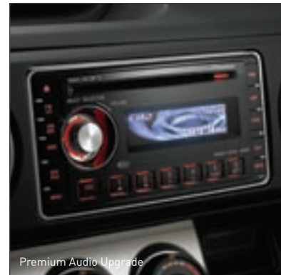
Premium Audio Upgrade

[See the xB, and xD sections for a complete listing of available accessories for each model]