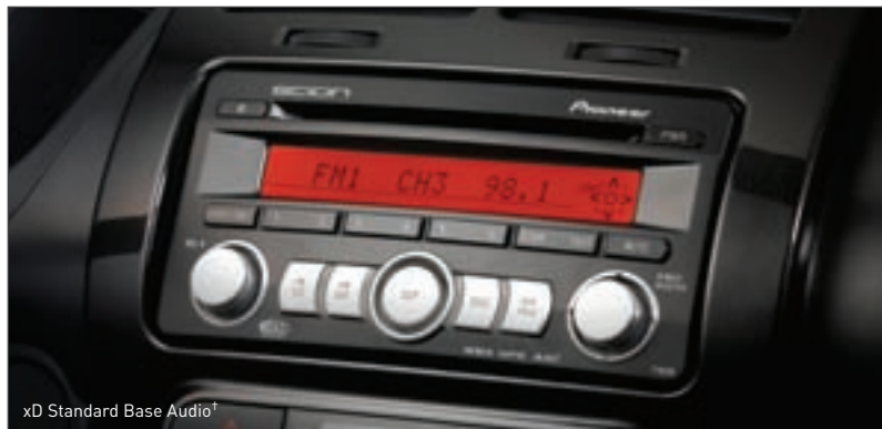
xD Standard Base Audio †

* iPod not included ** Satellite radio requires XM or Sirius compatible receiver and monthly service fee. See your Scion dealer for further details. Reception of the satellite signal may vary depending on location. All fees and programming subject to change. Subscriptions subject to the terms and conditions available at www.xmradio.com or www.sirius.com . Available only in the 48 contiguous United States. † Preliminary Interior Shown, Subject to Change