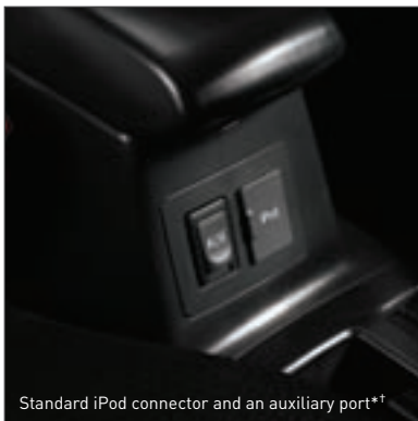
Standard iPod connector and an auxiliary port †

AM/FM/CD / maximum 160 watts of power / Six speakers (two tweets, four full-range) / Scion Sound Processing (SSP), tuned to the acoustic characteristics of the xB, xD, or tC / Sound Retouch (SRT) and Automatic Sound Levelizer (ASL) / Reads MP3, WMA, and AAC files / Programmable welcome messages / Both a standard iPod connector and an auxiliary port / Built-in pocket designed to hold a standard or nano iPod* / Satellite radio capability with accessory antenna**