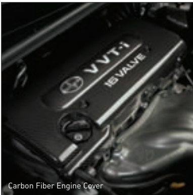
Carbon Fiber Engine Cover

CHOOSING WHEN AND HOW YOU WANT TO MODIFY YOUR CAR IS A LOT MORE FUN WHEN YOU'RE GIVEN ALL THE CHOICES. THE ONLY QUESTION IS: WHERE TO STOP?