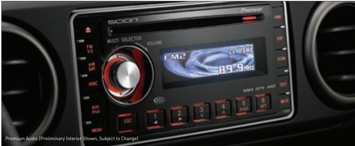
Premium Audio (Preliminary Interior Shown, Subject to Change)