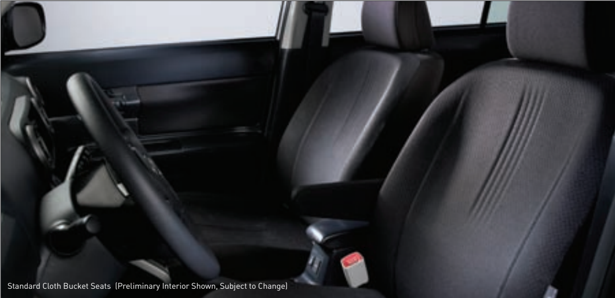
Standard Cloth Bucket Seats (Preliminary Interior Shown, Subject to Change)