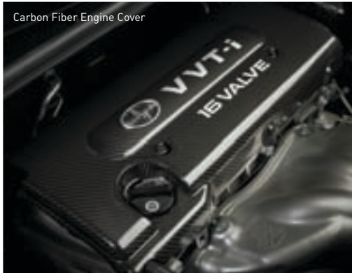
Carbon Fiber Engine Cover