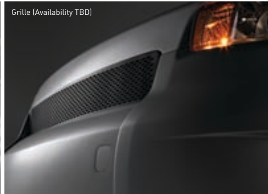
Grille (Availability TBD)