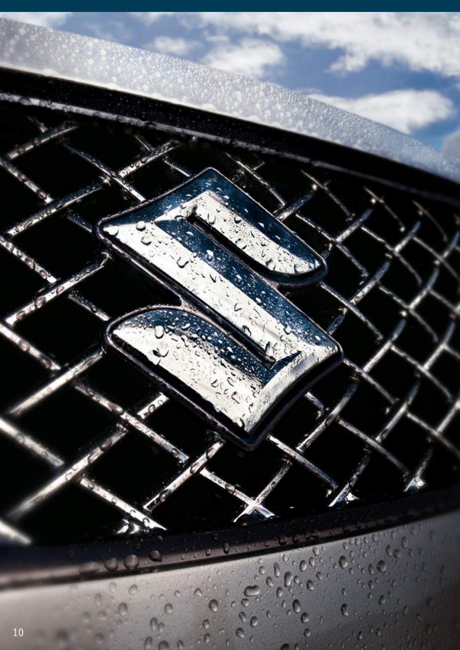
There's A Reason Every Suzuki Wears An "S" On Its Chest.