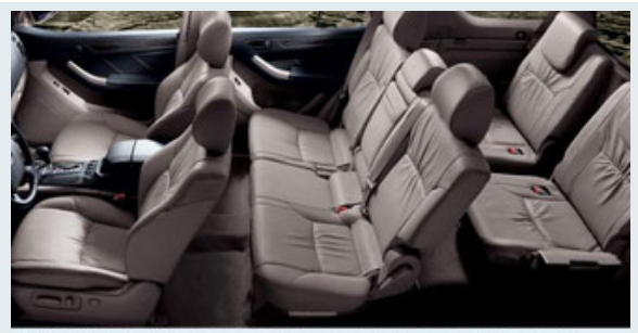
Limited 4WD leather-trimmed interior shown in Taupe with available third-row seat