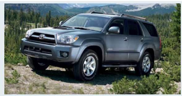
V6 Sport Edition shown in Galactic Gray Mica