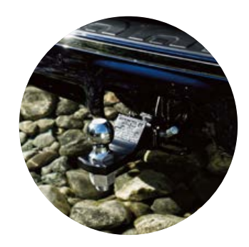
Ball mount<sup>4</sup>/trailer ball<sup>4</sup> Sold separately.