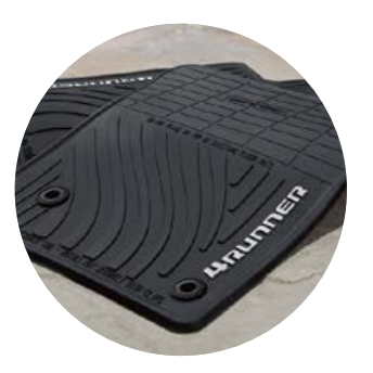
All-weather floor mats<sup>3</sup>