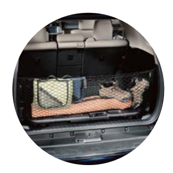
Cargo net - envelope