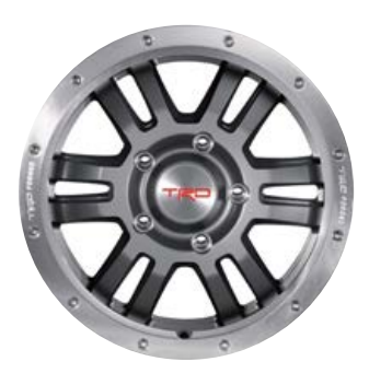
TRD 17-in. forged off-road beadlock-style wheels<sup>2</sup>