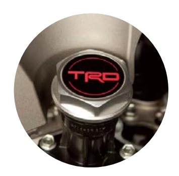
TRD oil cap