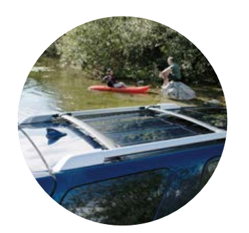
Roof rack cross bars

You own it, now it's time to make it yours. We can help outfit your 4Runner for almost any adventure with roof rack cross bars, a cargo tray or a cargo net. Need extra style? We've got you covered with TRD 17-in. forged off-road beadlock-style wheels, an exhaust tip and a TRD oil cap. You can even add all-weather floor mats<sup>3</sup> to help keep things clean. For a complete list of accessories, go to toyota.com/4runner.