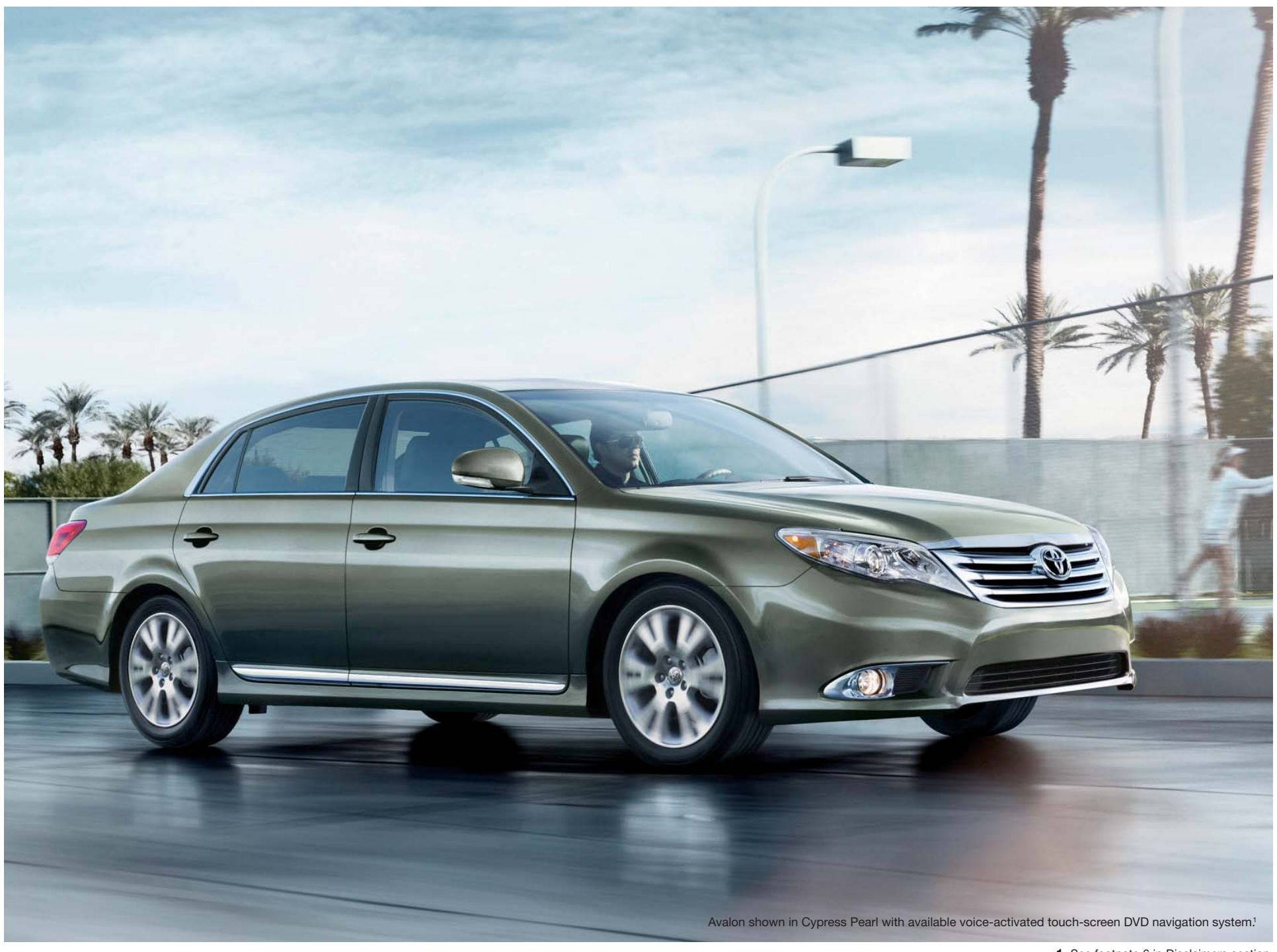
1. See footnote 6 in Disclaimers section.