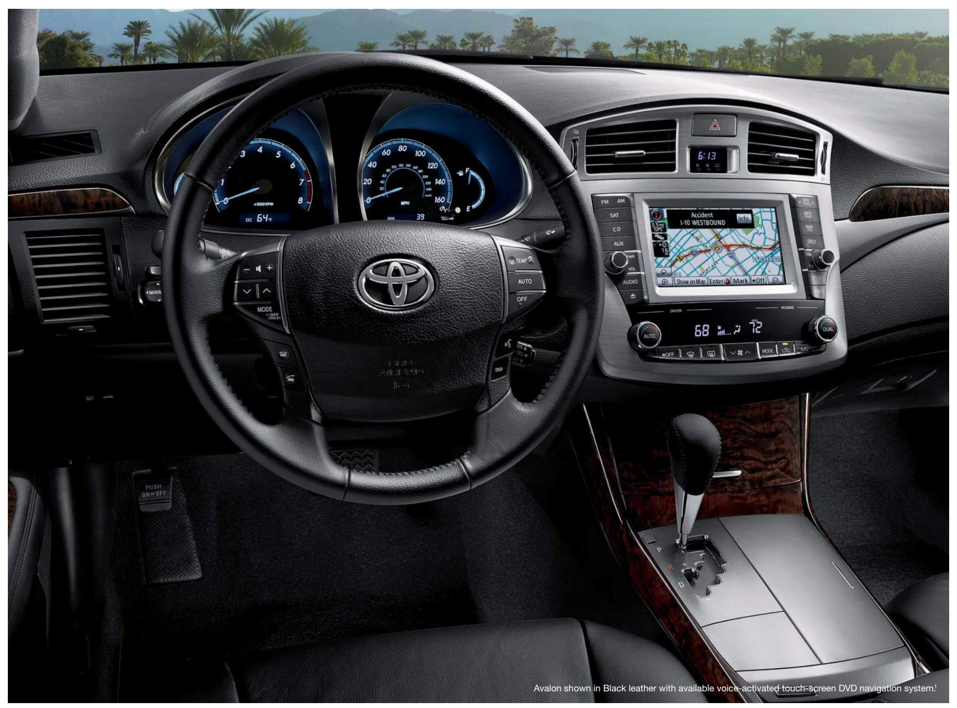
1. See footnote 6 in Disclaimers section.