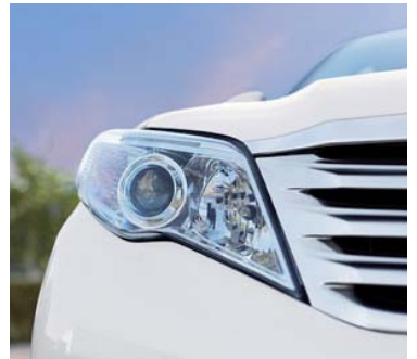
Avalon Limited's High Intensity Discharge (HID) headlamps look sharp and help you see sharp. Plus, they offer auto leveling, an auto on/off feature and Daytime Running Lights (DRL).