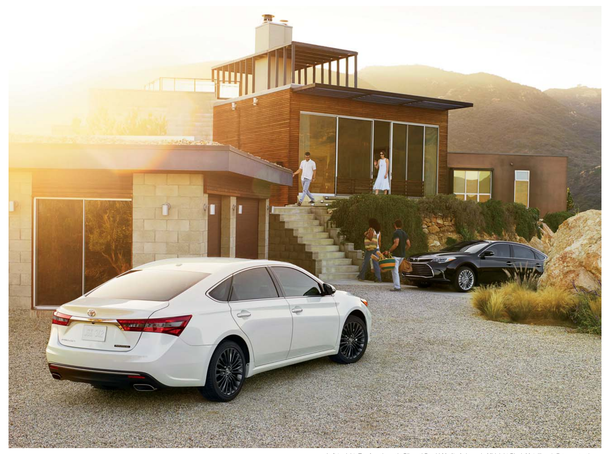
Left to right: Touring shown in Blizzard Pearl; Limited shown in Midnight Black Metallic. 1. Extra-cost color.